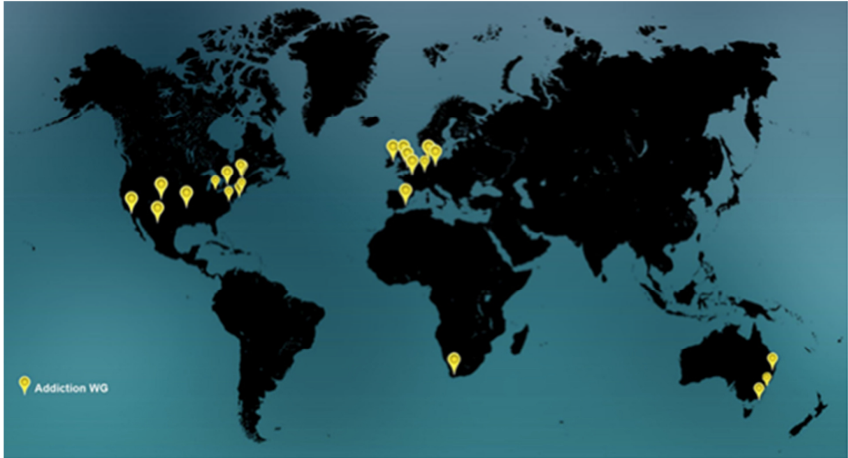
Figure 2. World map of the current membership of the ENIGMA Addiction working group.