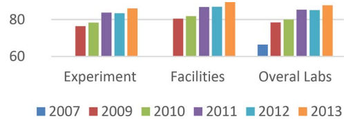
Fig. 2. Comparison of student satisfaction over time.

In 2007, a trial student survey was conducted to gauge the level of student satisfaction in the laboratories. Students responded to six statements about the experiments and facilities on a five-point Likert-scale from “Strongly Disagree” (1) to “Strongly Agree” (5). The responses were calculated using a weighted average. A comments field was also available to capture qualitative feedback. The average score across all