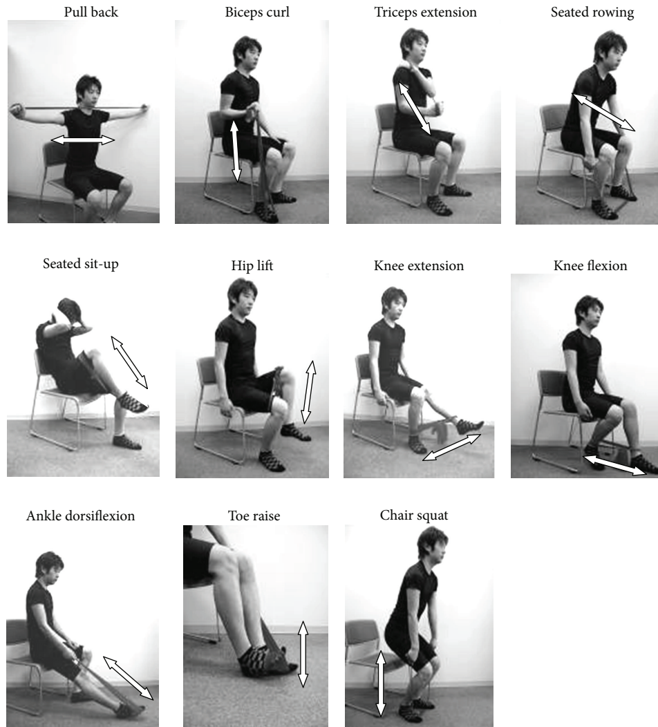
FIGURE 2: Resistance exercises undertaken in the community- and home-based setting. The resistance training program consisted of exercises that used an elastic resistance band (Thera-Band, Hygenic, USA). Each type of exercise was performed for 12 repetitions/session. Exertion was rated using Borg's rate of perceived exertion (RPE) scale.

(ANCOVA) adjusted for gender and within group changes by a paired t -test. All tests were two tailed and a P value of less than 0.05 was considered statistically significant. Values reported are the mean \pm SD.