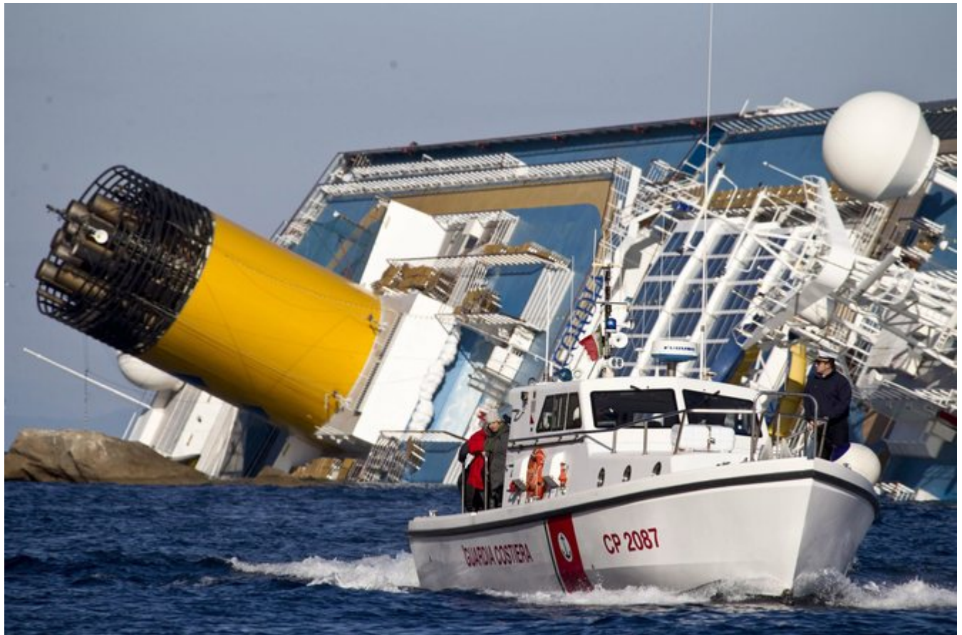
The grounded Costa Concordia', off Giglio Island, Italy, January 17 2012.