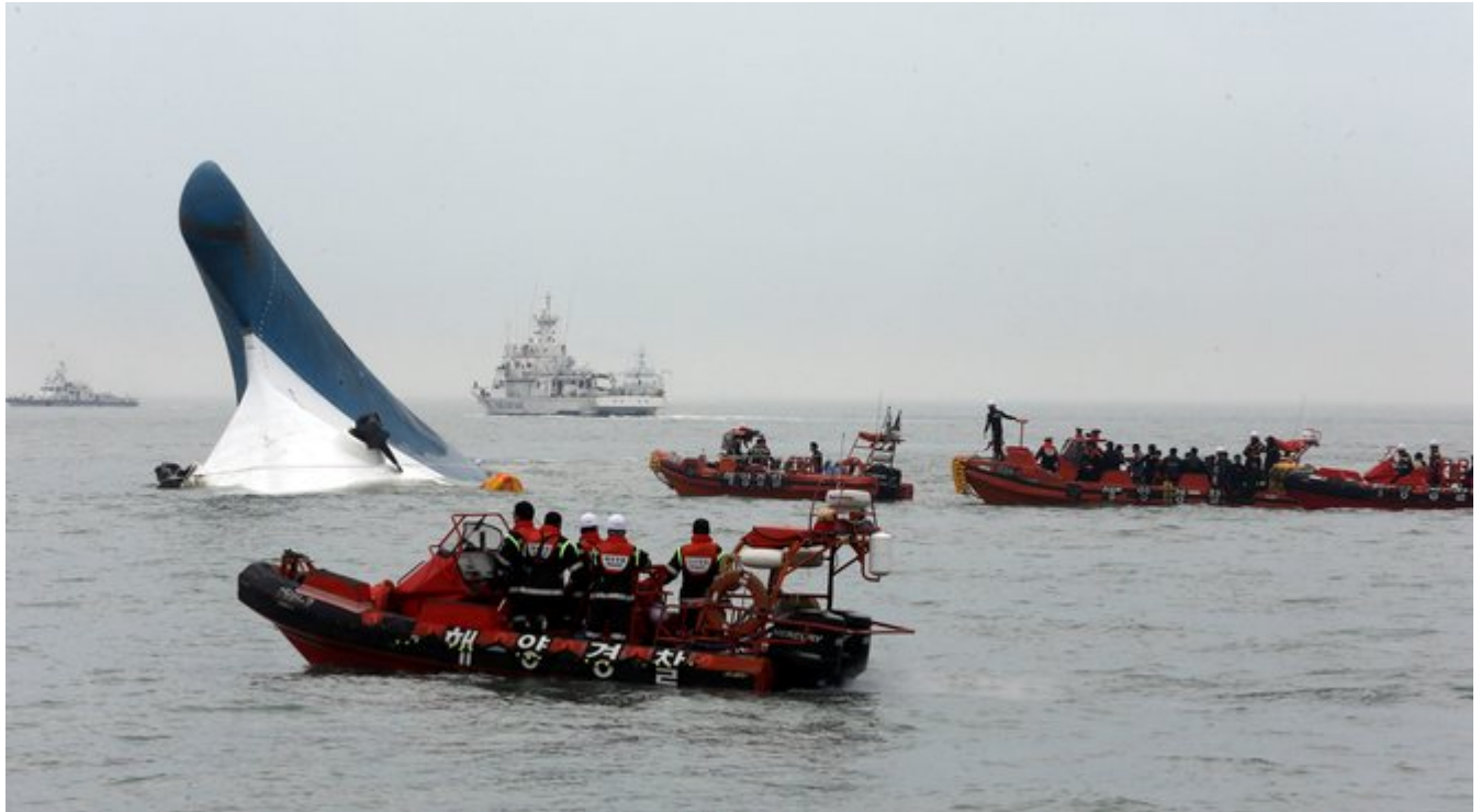
South Korean coast guard around the sunken ferry Sewol, off South Korea, April 16, 2014.