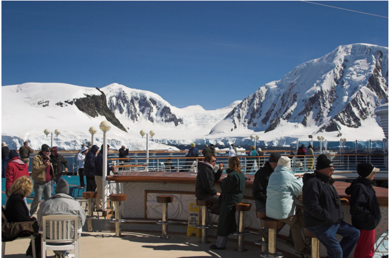
Passenger cruise ships increasingly exploring remote regions such as the Antarctic.