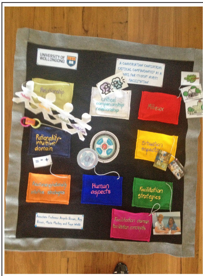
Figure 2: Poster for the Enhancing Practice Conference, Sydney, 2012