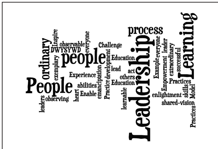
Figure 1: Wordle

As a health professional of my time and a product of my career choices, I was a transactional leader, as were all my role models, so being exposed to more transformational ways of working gave me choices.