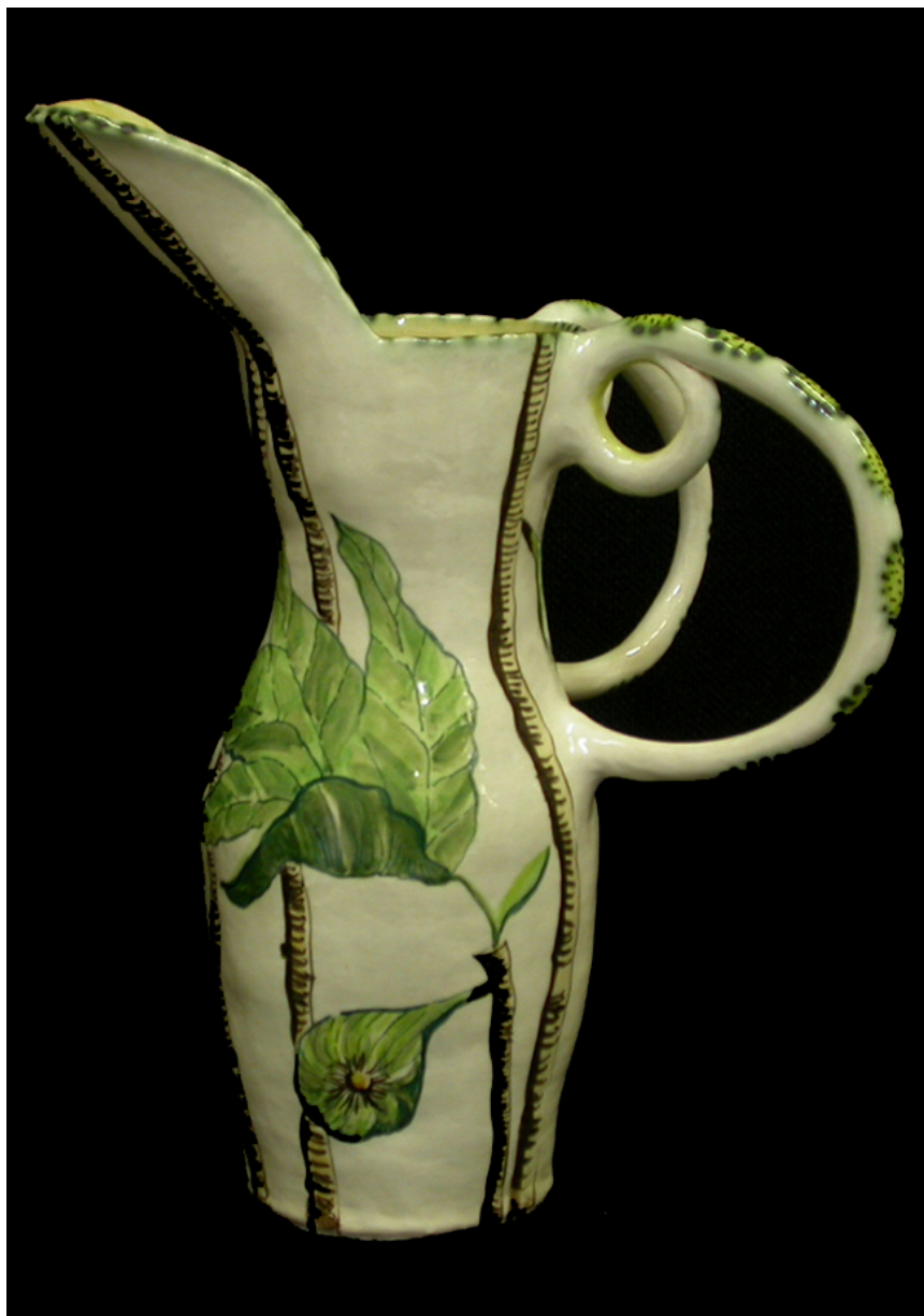
Fiona Hiscock, Hill End double handled fig pitcher , 2003, high-fired earthenware, hand-painted and glazed, 47 x 36 x 26 cm.