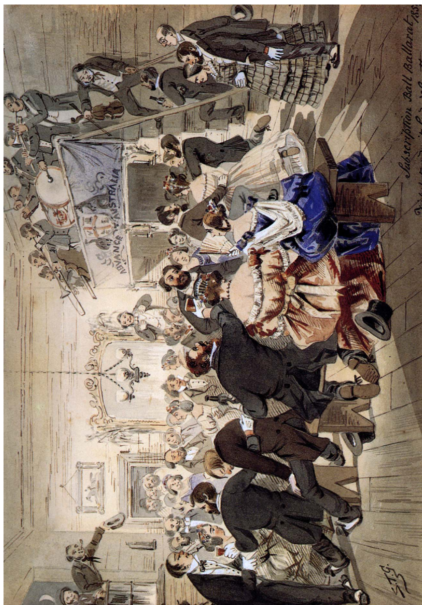
S.T. Gill, Subscription Ball, Ballarat , 1854, watercolour, 25.1 x 35.3 cm.