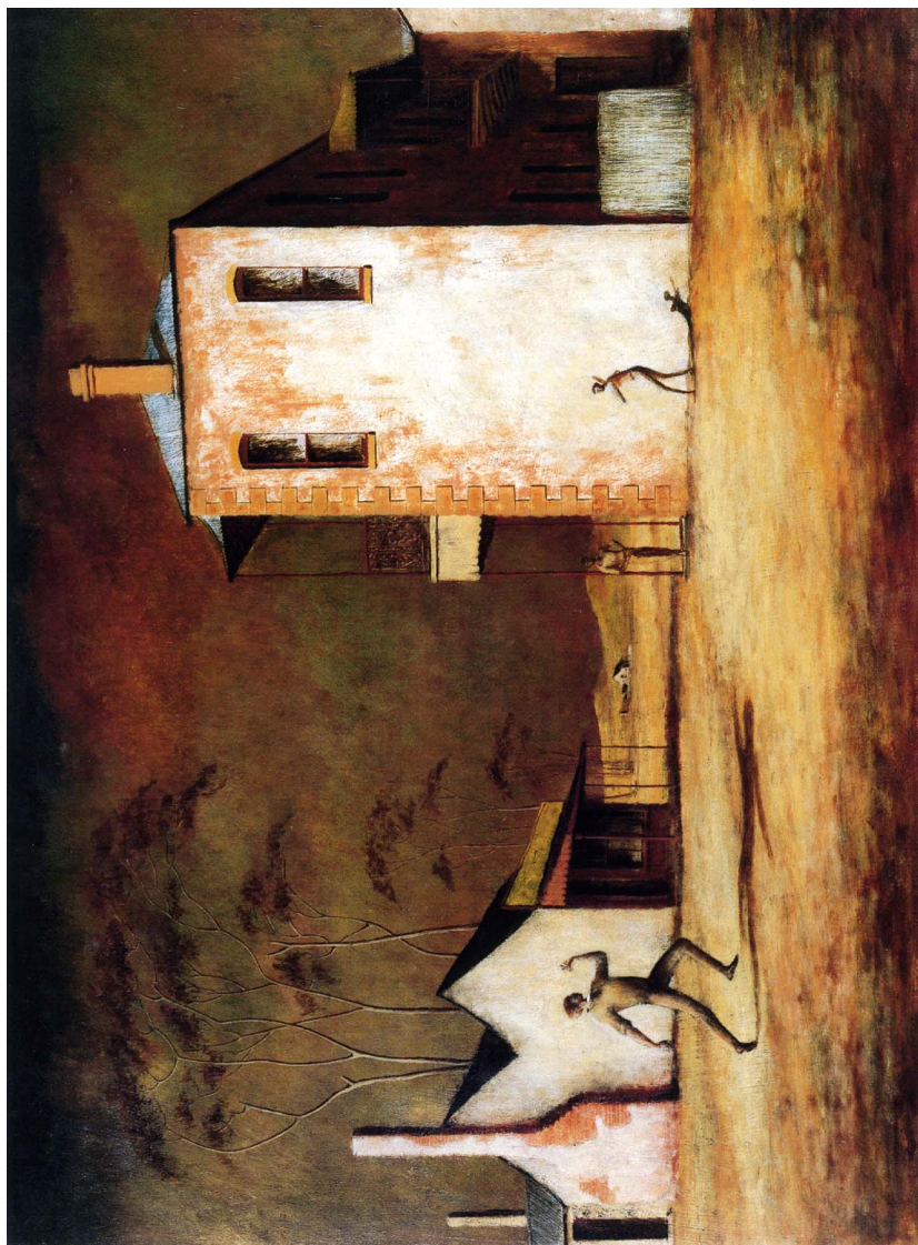
Russell Drysdale, The Cricketers , 1948, oil on hardboard 76.2 x 101.5 cm.