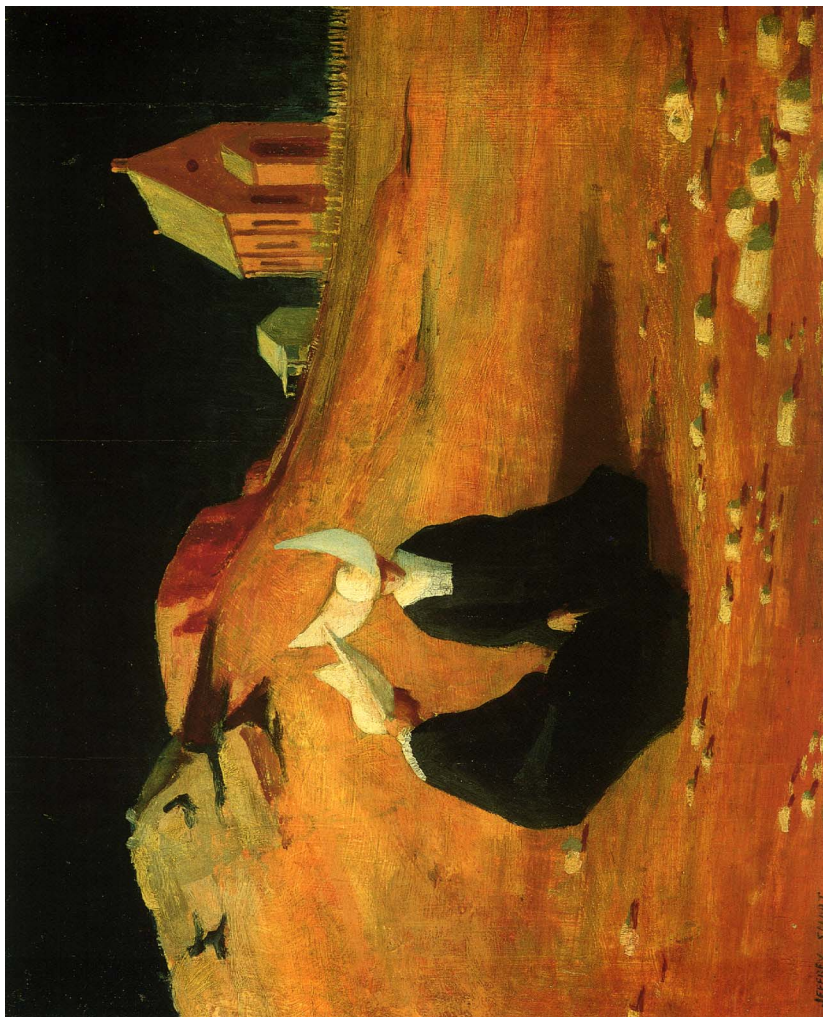
Jeffrey Smart, Nui's Picnic , 1957, oil on board, 34.5 x 43 cm.