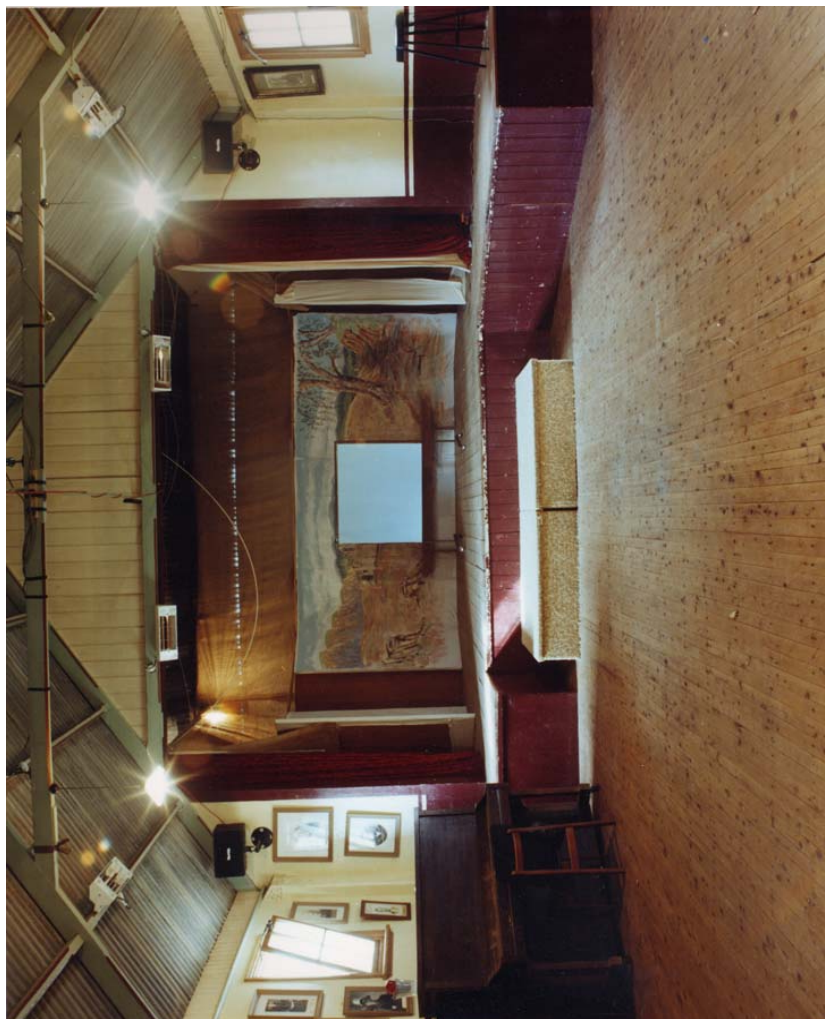
Catherine Laudenbach, Hall 1 , 2001, Type C print, 1000 x 800 mm.