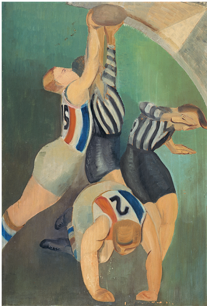
Fig 2. Mary Alice Evatt, Footballers , from the collection of Rosalind Carrodus