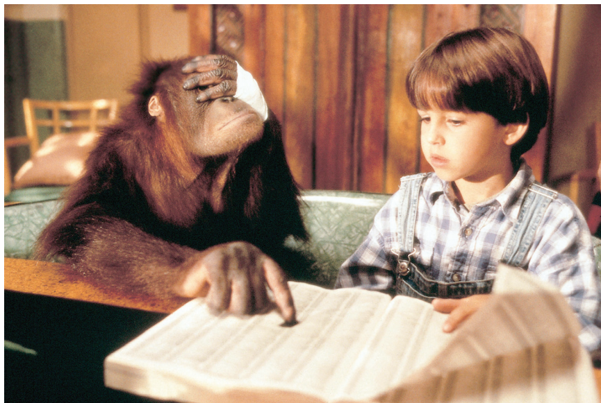
Fig. 4: Dunston Checks In .

Offered a chance to escape, he refuses to leave his cage until he can put on his clothes. 'I'm not dressed', he says to the waiting chimps, one of whom replies, 'But Thelonius, you're an orangutan'. He repeats, simply, 'I'm not dressed'. At the film's end, the animals are all safely ensconced at Farmer Hoggett's rural haven, but whereas the other apes take easily to the trees, Thelonius insists on staying in the house with the humans. Because the narrative is constructed from a zoo-centric perspective, the viewer can read past the anthropomorphism by which Thelonius's character is realised to register the finale as not only a critique of his (enforced) acculturation to human ways but also a suggestion that he has now chosen how to live amid limited options.