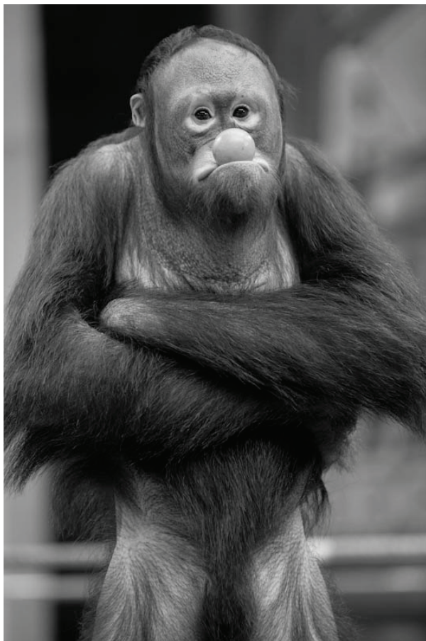
Fig. 1: The Disappearing Orange Trick.

‘I’m not looking for trouble as men are ... I like acting. It is so easy to amuse idle people.’ (Hornaday 62)