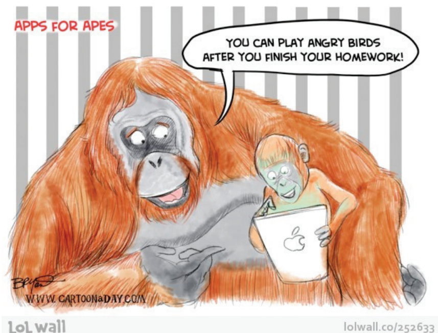
Fig. 5: Apps for Apes. Caroonist Bryant Arnold. (Content originally appeared on CartoonADay.com [http://www.CartoonADay.com], and is made available through a Creative Commons Attribution Noncommercial license [http://creativecommons.org/licenses/by-nc/2.5/].)

Eugene Linden proposes that we should understand orangutan intelligence as ‘the kind of mental feats they perform when dealing with captivity and the dominant species on the planet — humanity’ (online). Is there any compelling reason why such ingenuity could not be harnessed for genuine acting?