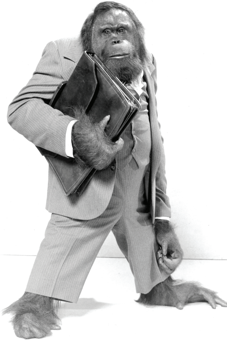
Fig. 3: Mr Smith.

show's heartthrob, Luis, not by transforming into a human but as the orangutan she is. In her daydreams, Luis feeds her strawberries on their couch and rubs her feet sensually, declaring that she has 'really grown on him'. He also brings her flowers after she has his children, and there is even a brief fantasy interlude in the