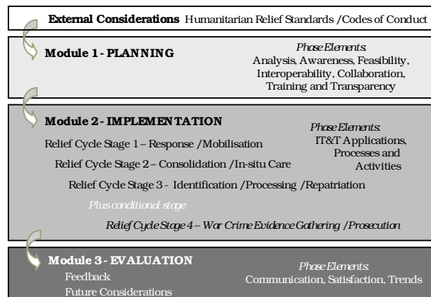
Diagram 2 Framework Modules - Components and Phases

Diagram 1 and 2 form the basis for another paper filled with explanatory descriptions of each framework module, and the overall “end-to-end” relief cycle. The framework can only work successfully when non-technical external considerations are taking into account every step of the way. It is hoped that this framework be evaluated by large relief organizations and eventually adopted as a standard.