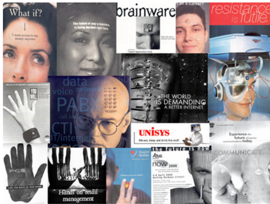
Exhibit 2. Advertising Campaigns Targeted at the Net Generation (N-Geners)

The human who has been implanted with a microchip is an Electrophorus , a bearer of “electric” technology. One who “bears” (i.e. a phorus) is in some way intrinsically or spiritually connected to that which they are bearing, in the same way an expecting mother is to the child in her womb. The root “electro” comes from the Greek word meaning “amber,” and “phorus” means to “wear, to put on, to get into”. To electronics something is “to furnish it with electronic equipment” and electrotechnology is “the science that deals with practical applications of electricity”. The Macquarie Dictionary definition of electrophorus is “an instrument for generating static electricity by means of induction.” The term “electrophoresis” has been borrowed here, to describe the act that an electrophorus is involved in. McLuhan et al. (1995, p. 94) believed that “...electricity is in effect an extension of the nervous system as a kind of global membrane.” The term electrophorus seems to be much more suitable today than that of any other term, including that of cyborg. And although implants are not exactly “electronic”, the systems they communicate with cannot run without electricity (exhibit 2).