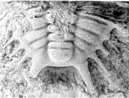
The cephalon (upper photo) and pygidium (lower photo) of an undetermined genus and species of dolichometopid trilobite (order Corynexochida) from the Middle Cambrian of the Cobb Valley area of northwest Nelson.