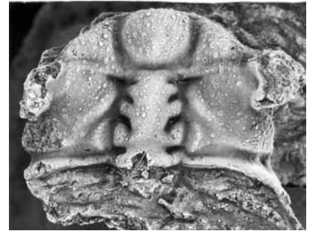
The cephalon of an undescribed species of Nepea (order Ptychopariida) from the Middle Cambrian of the Cobb Valley area of northwest Nelson.