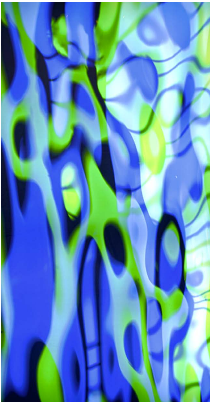
Tim Maguire Redleaf II 2010 Duratrans in lightbox, edition 1/2 Collection of The University of Queensland, purchased 2011 Reproduced courtesy of the artist and Tolarno Galleries, Melbourne Photo: Carl Warner