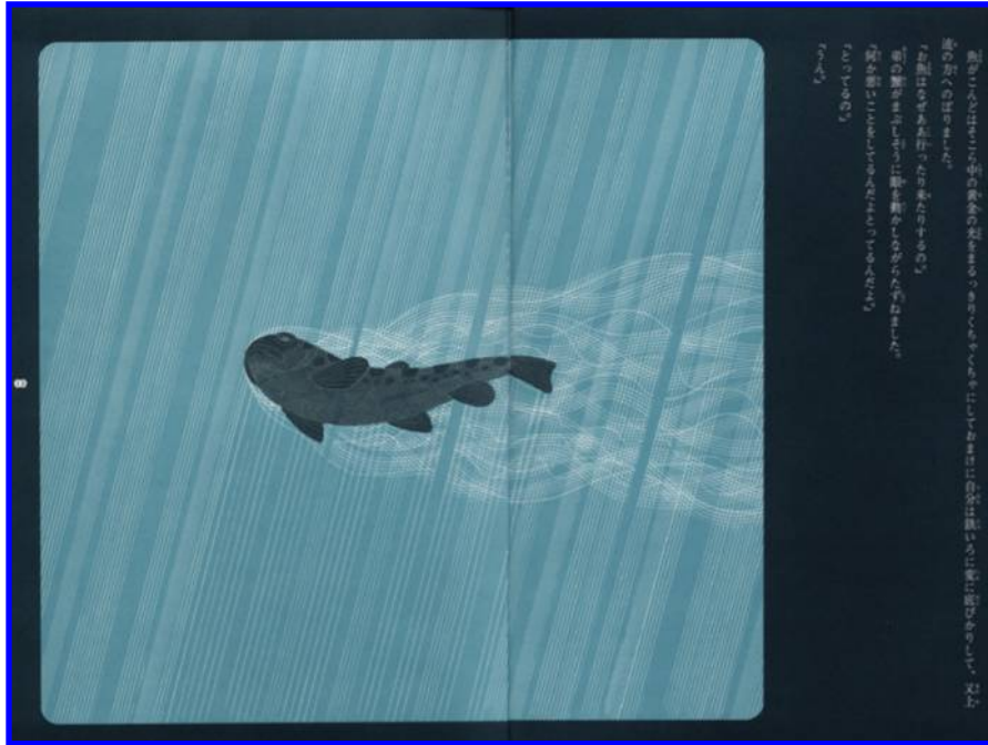
Fig. 3. Kobayashi Toshiya. Plate 6 from Yamanashi: Gahon Miyazawa Kenji . Tokyo: Paruru Sha, 1985.

the ambiguous figure laughed and died. This visual elusiveness further reiterates the sense of blurry, refracted light in the verbal imagery where everything ‘looks all steel-blue and dark’ (青くくらく鋼のやうに見えます / Aoku kuraku hagane no yau ni miemasu ). (6). Access into this space is yielded in accord with the uncertainty of the infant crabs about their environment and belonging. The lack of clarity in these early pictures thus works dialogically with the ambiguity about Klammbon, emphasising the mystery yet cohesiveness of Buddhist co-existence in Nature.