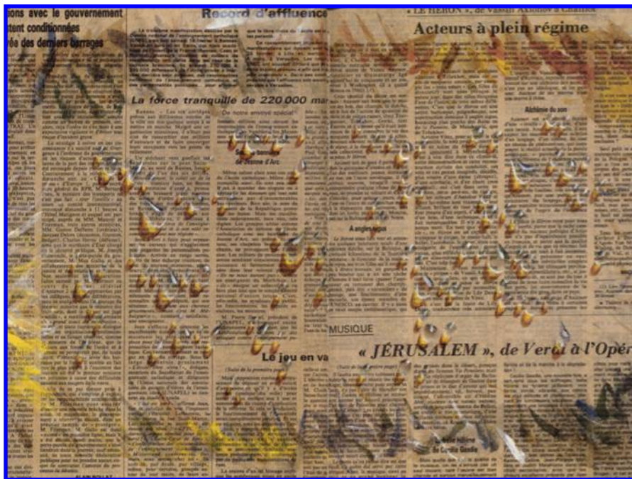
Fig. 4. Kim Tschang Yeul. Plate 1 from Wild Pear: Yamanashi . Trans. C. W. Nicol and Gan Tanigawa. Illus. Tschang Yeul Kim. Tokyo: Monogatari Têpu Shuppan, 1984.

inside/outside groupings prevalent in Japan and elsewhere). Kim portrays his artistic replicas of a profusion of waterdrops against foreign newspapers daubed with paint, maps of Europe, leaves, and so on. In the first spread which follows the narrative's single line introduction of the slides, for instance, his realistic water droplets are spread across an apparently old, yellowing French newspaper daubed with paint (see Figure 4). These visual representations are clearly extraneous to the story, creating a certain dissonance between narrative and picture. All require imaginative leaps to draw links with the narrative, encouraging the reader to question the relationship between the represented materials and story: Whether the drops and newspapers are painted or photographed, real or constructed, old or current? And why French newspapers or European maps? What effects or meanings do the drops and different background surfaces represent? There is no single answer to these questions but there are some possible explanations as to how these signs interact with the story to signify the transcendence of existing homogeneous cultural epistemologies and tensions.