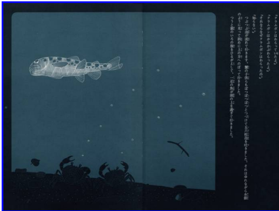
Fig. 1. Kobayashi Toshiya. Plate 3 from Yamanashi: Gahon Miyazawa Kenji . 1985. Tokyo: Paruru Sha, 1996.

about the unknown Klammbon's laugh, both the crabs and the river bottom abruptly disappear, thrusting the onlooker into a first person perspective (see Figure 2). The viewer is now completely drawn into the crabs' world, directly aligned with their viewpoint, seeing only the lines of white light and blue shadow above with them. The audience is thus confronted with a sense of their fright about the processes of life and death. This rupturing of the previous third-person-positioning emphasises the non-Buddhist-like fear of incursion into one's own 'natural' territory. Together with the suddenness of the shift, such alignment with their viewpoint increases climactic tension, enhancing psychological unease. Although the unexpectedness registers a sense of Buddhist ephemerality, the perspective of angst creates an apprehension both for and with the crabs, precipitating the ensuing kingfisher attack.