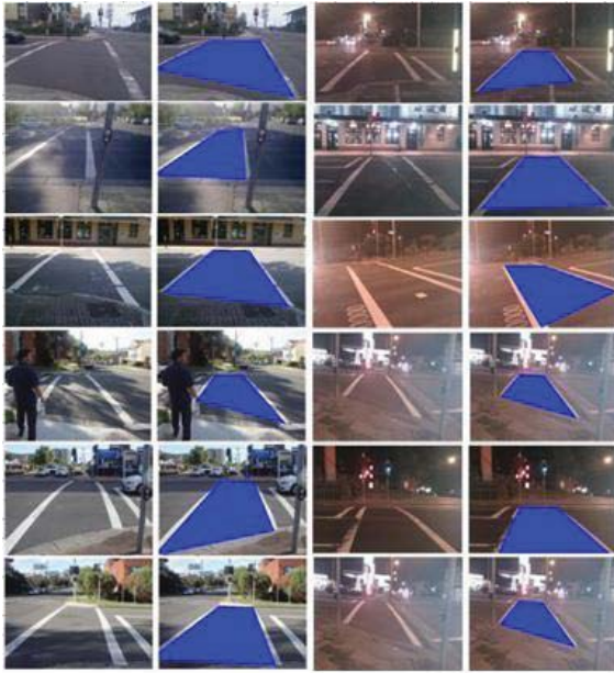
Figure 3. Visual results of lane detection. Columns 1 and 3: input images. Columns 2 and 4: detected pedestrian lane regions.

For comparison purposes, we implemented the Hough transform-based method (HT), which is commonly used in lane detection, e.g. [7]. Another method used for the comparison is the work of Lee and Cho [5] using colour information to extract lane marker pixels and edge orientation information to estimate lane boundaries. The detection performance of these methods are summarised in Table 1.