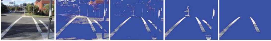
Figure 1. Illustration of the proposed method. From left to right: input image, result of colour-based segmentation, result of local thresholding, results of small components (noise) removal, detected lane markers.

lane markers. In particular, the p(o_{ij}|\omega_1) is modeled using the sigmoid function as