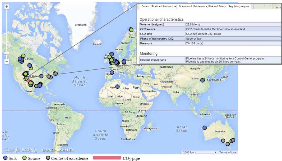
Figure 2 Interactive map tool for accessing CO 2 pipeline database. (demo version available at http://www.globalccsinstitute.com/publications/CO 2 -pipeline-infrastructure )

The results of the study have been captured in a CO 2 pipeline database and accompanying reference manual document. To enable convenient access to the collated information an interactive web tool was prepared based on Google Maps. It shows the location and routing of the 29 CO 2 pipeline projects investigated in this study and allows users to zoom in and access a summary of information from the database (see screenshot in Figure 2).