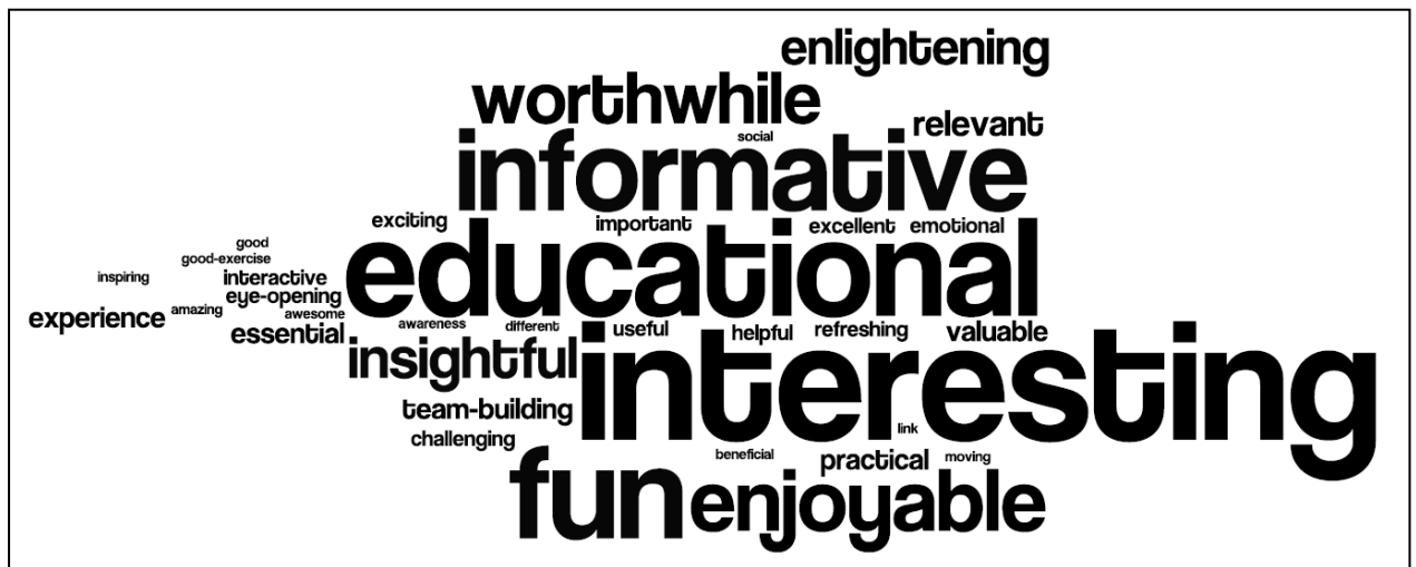
Figure 2. Wordle Output for Redefining Eden students – Words to Describe the Fieldtrips (most mentioned 35 words of 116 words)