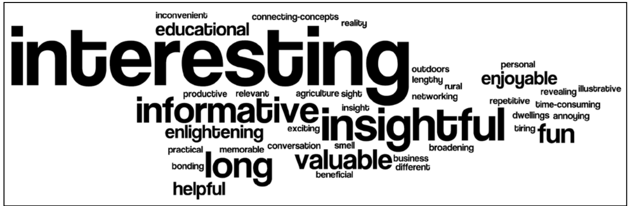
Figure 1. Wordle Output for Social Spaces students– Words to Describe the Fieldtrips (most mentioned 40 words of 54 words)