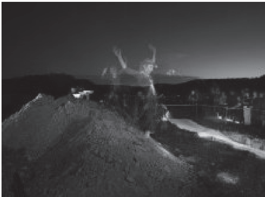
Fig 2. The gothic depictions of the performance offer a faithful reproduction of the impact of some of the work. Audience members responded positively about the affective and aesthetic qualities of the performance and expressed a keenness to see further development of the work.

The format devised for Siteworks 2 intensified the contact between participants. It comprised a full week with invited artists and scientists in residence, called The Lab, allowing time for further practical investigation and preparation, during which time invited specialists attended for day long visits. This culminated in the Field Day, when the residents presented their findings across the whole Bundanon site to a public gathering. This was reinforced on the following day by The Conversation, a public symposium addressed by environmental and life systems scientists and invited artists. The Siteworks project will be the subject of a later more detailed research report.