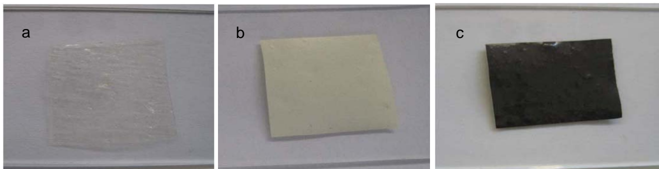
Figure 1. Optical images of typical films prepared by evaporative casting of (a) chitosan solution; (b) chitosan-TiO 2 dispersion; and (c) chitosan-Ag dispersion. Dimensions of films are 2.0 cm × 2.0 cm ((a) and (b)) and 3.0 cm × 2.0 cm (c). All films were prepared using chitosan batch CHM1.

The mechanical properties of chitosan (CH0) films, i.e. , Young's modulus ( E ) = 1,223 \pm 173 MPa, tensile strength (TS) = 39 \pm 5 MPa, toughness ( T ) = 2.45 \pm 0.08 J g -1 and strain-at-break ( \gamma ) = 10 \pm 2\% (Figure 2 and Table 1) are a result of the polymer conformation and the attraction energies (electrostatic attraction, van der Waals forces and hydrogen bonding) between the chitosan chains [17]. Inclusion of glycerine (a well-known plasticizer) significantly reduces the mechanical properties, but increases the strain-at-break hereafter referred to as extensibility (Table 1). For example, addition of 30% glycerine (by weight relative to chitosan) results in a decrease in Young's modulus (from 1223 \pm 173 MPa to 25 \pm 7 MPa), tensile strength (from 39 \pm 5 MPa to 6 \pm 1 MPa) and toughness (from 2.45 \pm 0.08 J g -1 to 1.27 \pm 0.01 J g -1 ), while the extensibility increased from 10 \pm 1\% to 32 \pm 2\% . This behaviour is in excellent agreement with the well-known plasticizing effect of glycerin [20].