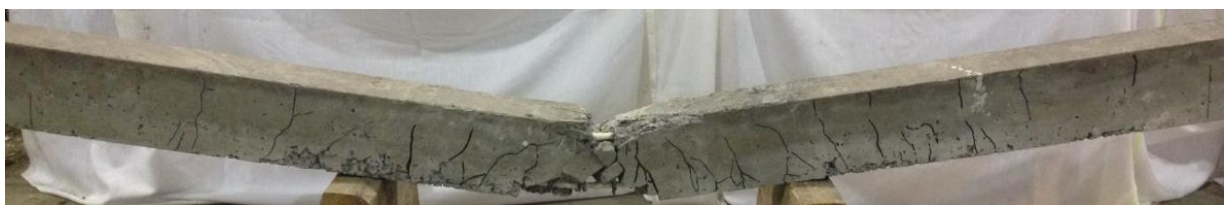
Figure 6 Dynamic Punching Failure and Crack Propagation of GFRP RC Beam 120 II -#3HM-1.0-I-0.710