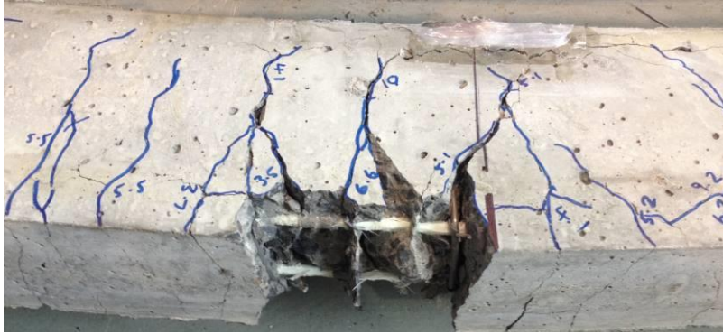
Figure 3 GFRP Reinforcement Rupture of Under-Reinforced GFRP RC Beam