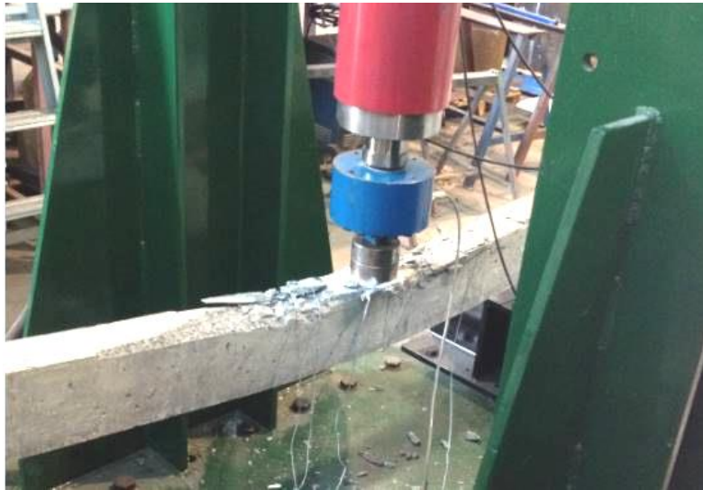
Figure 4 Concrete Crushing of Over-Reinforced GFRP RC Beam