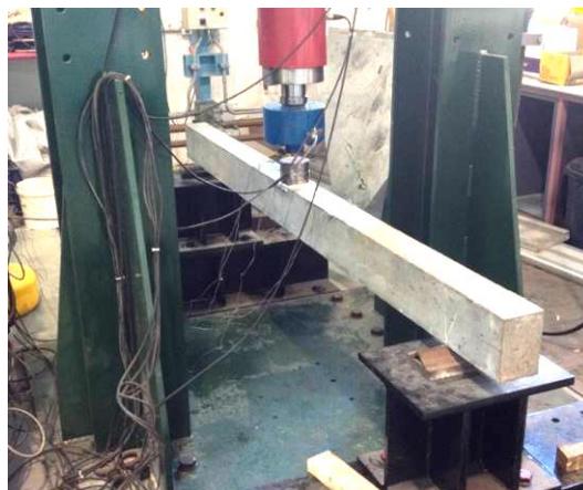
Figure 1 Experimental Set-up for GFRP RC Beams under Static Loading

The beams were simply supported, with a pin support at one end and a roller support at the other end as shown in Figure 1. The simply supported conditions allowed for the GFRP RC beams to deflect under static loading. A 600 kN hydraulic actuator anchored to an independent steel frame was used to apply a monotonic increasing load on a steel circular plate positioned at the mid-span. The hydraulic actuator was also used to measure mid-span deflection. GFRP RC beams were tested under displacement controlled loading at a rate of 1 mm/min until failure. Two electrical resistance strain gauges were attached at the top on each side of the GFRP RC beams, directly underneath the position of the load cell for measurement of concrete strain. One strain gauge was attached to each of tensile GFRP reinforcement bars, at the centre for measurement of tensile strain. All data including load, mid-span deflection and strain were recorded using the high speed data acquisition system,