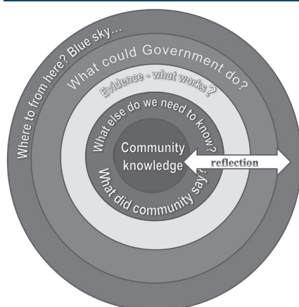
Figure 1: The storyboard.

An advisory committee and individuals involved in program delivery to Aboriginal communities provided advice on the research methodology.