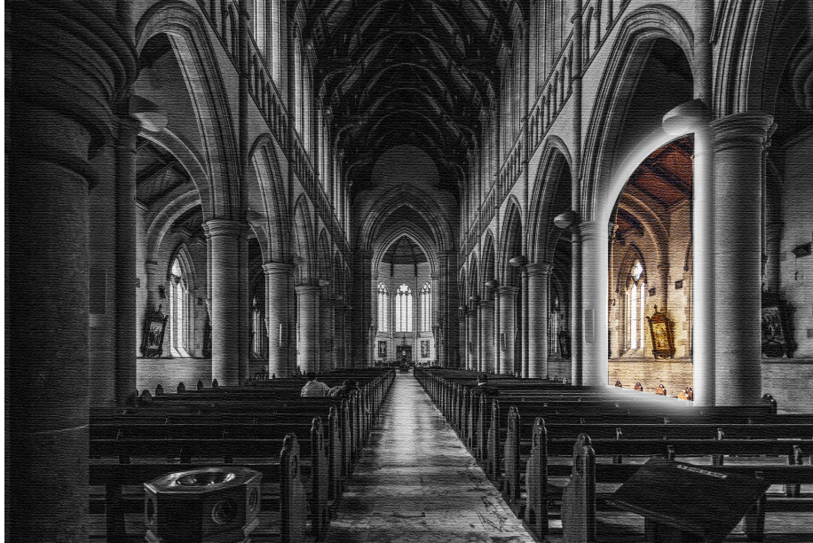
Figure 1: Imaginary virtual memory palace with a suggested locus highlighted.

associated with spatial navigation are involved in the use of the memory palace. As such, we think approaches where users are either passively moved or there is no movement at all, do not support the optimal unfolding of a memory sequence.