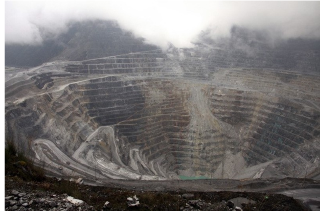
Freeport's Grasberg mine in West Papua.

West Papuan natural resources, wreaks havoc on the environment and local communities, yet yields negligible benefits to Papuan people 7 .