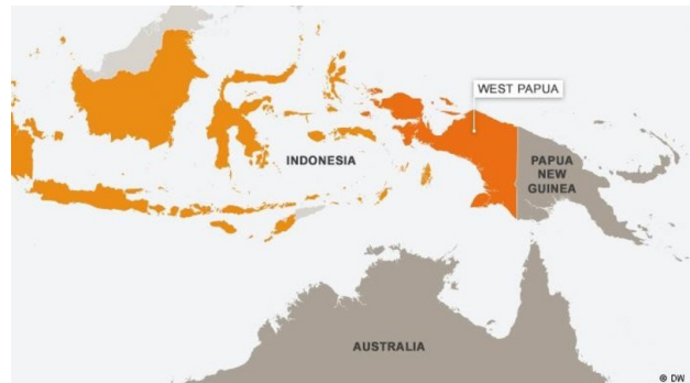
Map showing West Papua on the island of New Guinea in relation to Australia and Indonesia.

However by forging digital activist networks locally and internationally—including building West Papuan-indigenous Australian partnerships, West Papuans are participating in a grassroots democratization process with global outreach, refusing to be sacrificed on the altar of regional realpolitik . The article concludes with a cautionary account of an apparent attempt by an opportunistic Australian political movement to hijack West Papuan democratization for its own ends, a threat West Papuan and Australian civil society activists are currently moving to contain.