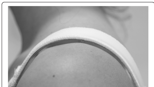
Figure 2 The Dermis Plus Polymer gel pads. These were cut into strips and placed under the standard width bra strap design to create the gel strap design. Each gel pad was cut into four equal 10 cm × 2.5 cm strips, which were positioned end to end and then placed under the standard width bra straps, so that the gel material was flush with the bra strap and in direct contact with the participant's skin.

Bra strap discomfort was measured immediately after the running trials using a VAS (rated 0 to 10), whereby 0 represented 'no discomfort' and 10 represented 'worst possible discomfort'. The perceived reason for any bra strap discomfort was also reported, and at the end of the test session, participants selected their most and least preferred bra strap orientation and design.