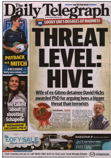
Figure 1: The Daily Telegraph front page, triggered by a doctoral thesis, 26 May 2017.

In the context of the media, a beat-up is a story that, by conventional journalistic standards, does not deserve to be published because it is unverified, grossly exaggerated and/or knowingly false. Typical features of beat-ups include presenting manufactured claims, giving otherwise unexceptional information