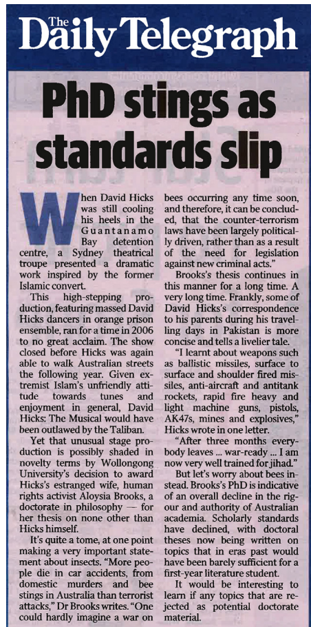
Figure 3: The Daily Telegraph editorial 'PhD stings as standards slip', page 30, 26 May 2017.

During the 21st century, terrorism has been an insignificant cause of mortality in the United Kingdom. The annualised average of five deaths caused by terrorism in England and Wales over this period compares with total accidental deaths in 2010 of 17,201, including 123 cyclists killed in