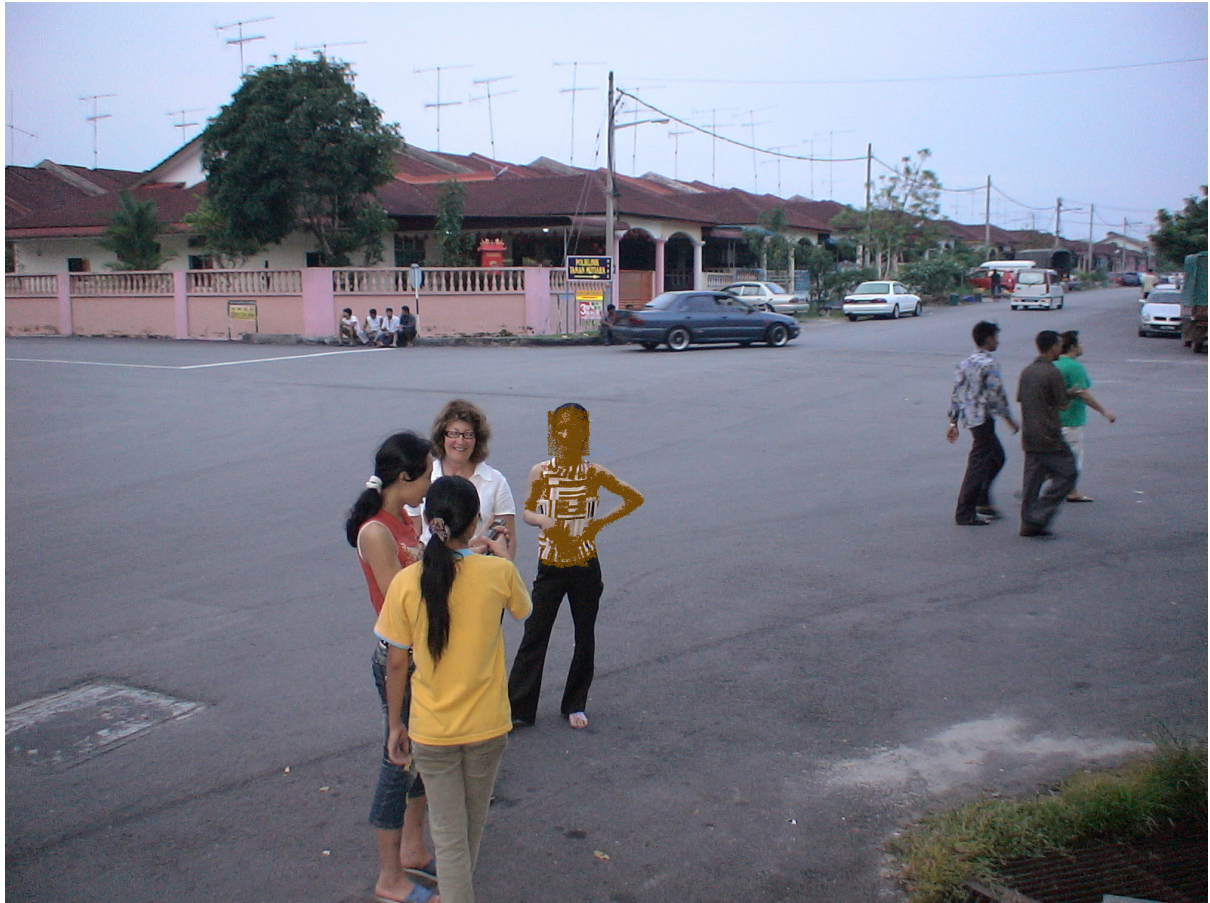
IMAGE 2 : The undocumented “garlic” worker received support from other migrant workers in Malaysia (Tran, 2008).