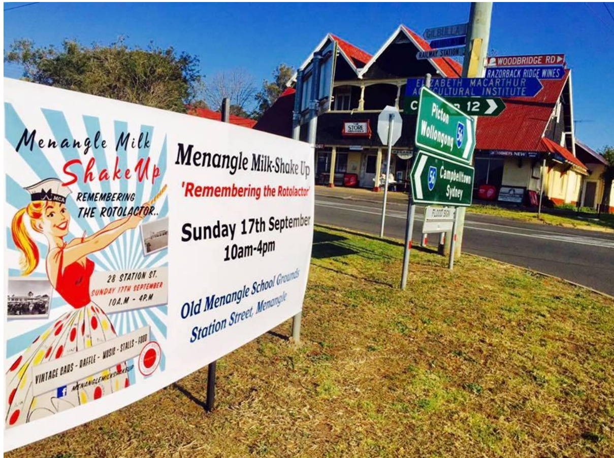
Figure 5 The Menangle Community Association held a community festival that attracted thousands of visitors to the village. In the background of this image is the Menangle General Store built in 1904 designed architects by Sulman and Power for Camden Park Estate (MCA, 2017)