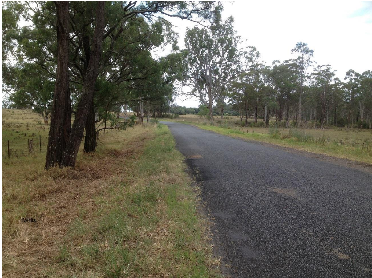
Figure 3 Moreton Park Road precinct located east of the Menangle village and adjacent to South Western Freeway and Southern Railway Line (I Willis, 2017)

The Moreton Park Road proposal generated disquiet amongst Menangle residents. Resident Ray Smith maintained that the proposal would ‘change the character of the town and ruin their reasons for choosing Menangle as their home’. Smith stated that, ‘the rural atmosphere will be turned into an industrial one’. ( Camden Advertiser , 1 December 2004) Menangle resident Kathryn Terry, who thought that ‘the whole atmosphere of the area would be destroyed’ organised a protest meeting in December 2004 attended by around 70 residents. ( Camden Advertiser , 12 January 2005) This community activism fostered resistance to the proposal over the next 15 years.