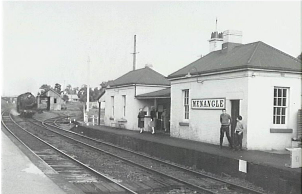
Figure 4 Menangle Railway Station on the Southern Railway Line between Sydney and Melbourne with a steam train approaching the station from the south (Campbelltown City Library, 1963)

Wollondilly Shire Council strengthened the historic protection of the village by adding Menangle Railway Station and part of Moreton Park Road to the village conservation area and the local environment plan. (Betteridge, 2012, pp. 19-20) The new association held a historic photographic exhibition and launched a campaign to create a landscape curtilage around the village precinct. (Menangle Action Group & Menangle Community Association, 2010, pp.3-5)