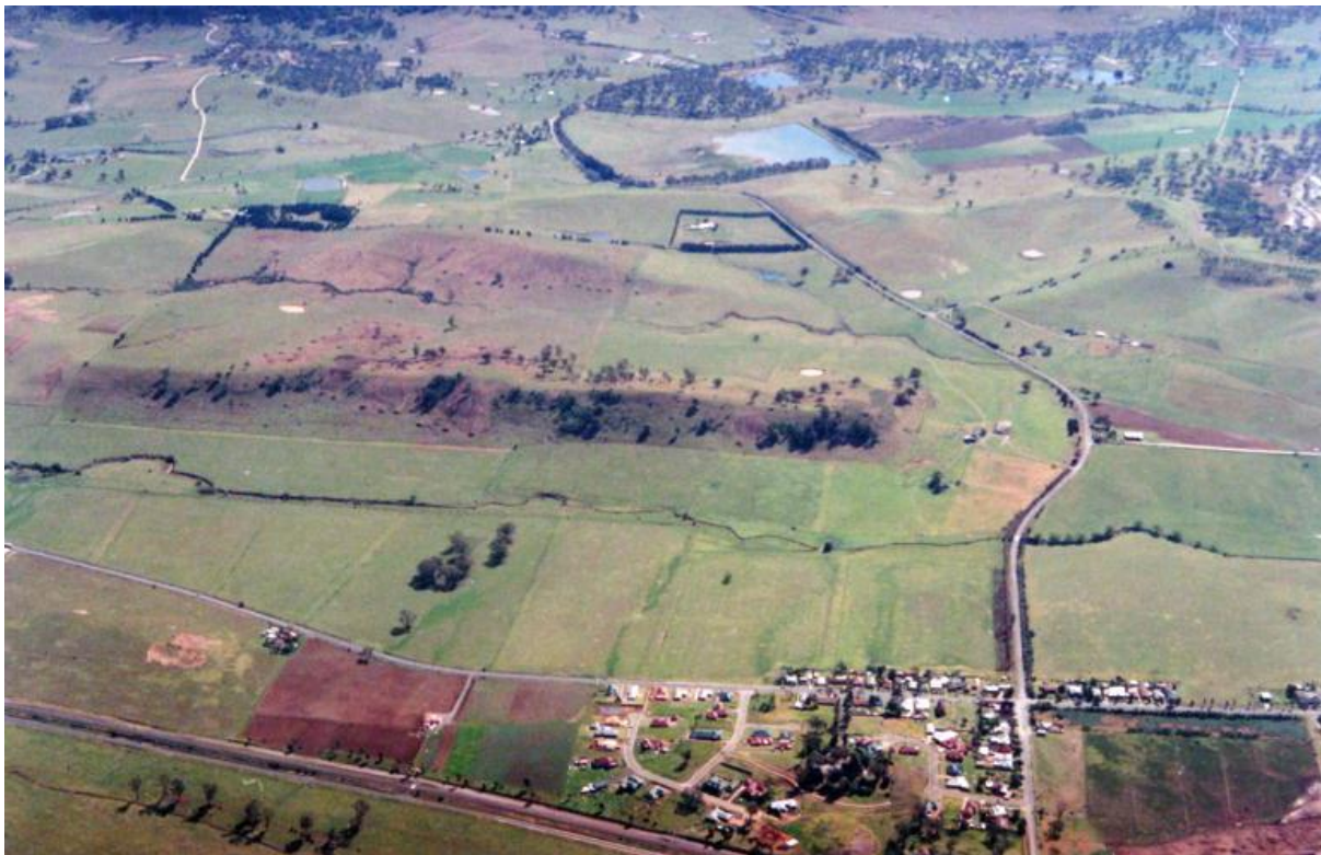
Figure 2 Aerial view of Menangle village showing the Southern Railway in bottom left of image. The rotolactor paddock is bottom right of image (Camden Images, 1996)

The state sponsored planning processes that background the development proposals discussed in this paper take place under the administration of a number of state governments. They started with the Askin Coalition state government (1965 to 1975) which developed the Sydney Region Outline Plan. In the early 1970s both the state and federal governments came under community pressure around heritage issues which were subsequently reflected in planning proposals for the Macarthur region, which included Menangle. The paper then moves onto the recent development proposals at Menangle and the planning regimes of the Carr Labor government (1995 to 2005), followed by Labor Premiers Iemma (2005), Rees (2008), and Keneally in 2009. The planning regime was changed by the election of the O'Farrell Liberal-National Party Coalition government (2011 to 2014) and consolidated by later Coalition leaders Mike Baird (2014) and Gladys Berejiklian (2017).