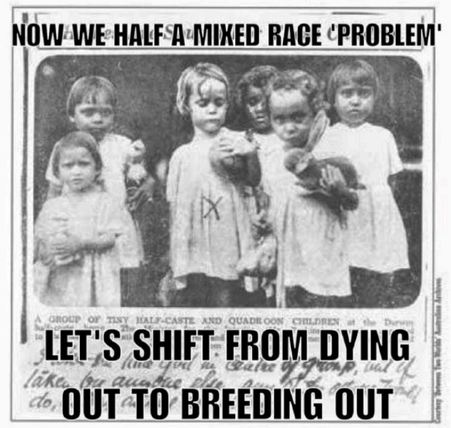
Figure 3. “Now we have a mixed-race ‘problem’” (BFR, 2016).

Through the sequence, we can see that the ideologies and practices mobilized to contain and exclude Indigenous Australians during and beyond the formal colonial era have shifted greatly over the past two centuries. But it is also clear that, despite these variations, colonialism persists. As Buchanan (2017, p. 463) points out, as a rule, “assemblages always strive to persist in their being [. . .] they are subject to forces of change, but ultimately they would always prefer not to change.” While the expressive justifications and material practices of Australian colonialism have varied over time in response to forces of change, the assemblage remains. While we now recognize that people lived in Australia long before British colonialism, they