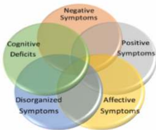
Figure 1. The Heterogeneous Nature of Schizophrenia