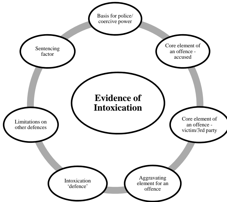
Figure 2: Legislative Approaches to Defining Intoxication in Criminal Law