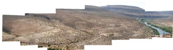
The open-air site Uitspankraal 7 in the Western Cape of South Africa, where unexpected artefacts were found. Alex Mackay

If the Nubian cores found in south-west Asia reflect an information system shared with the contemporary inhabitants of the greater Nile Valley, these artefacts would constitute the earliest evidence for modern humans outside of Africa. This would also push back the date for our first excursions into the rest of the world. One important thing about Nubian cores is that their occurrence has always been constrained to north-east Africa, making their distribution a plausible candidate for a shared cultural system.