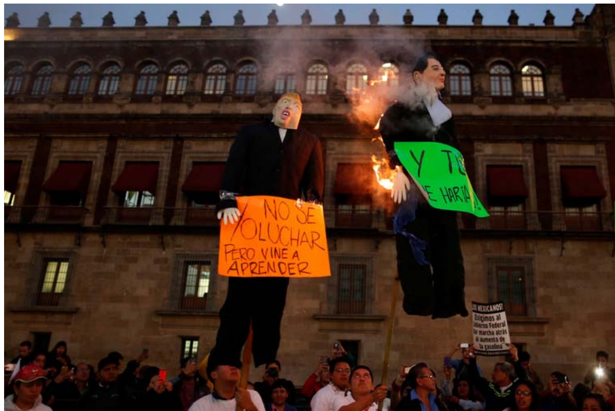
Mexico is now a tough crowd for Trump and Peña Nieto.

demanded that Peña Nieto cancel his visit to Washington.