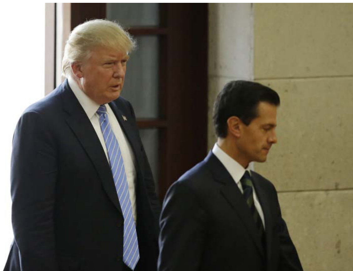
Trump and Peña Nieto during the Republican candidate's controversial August 2016 visit to Mexico.