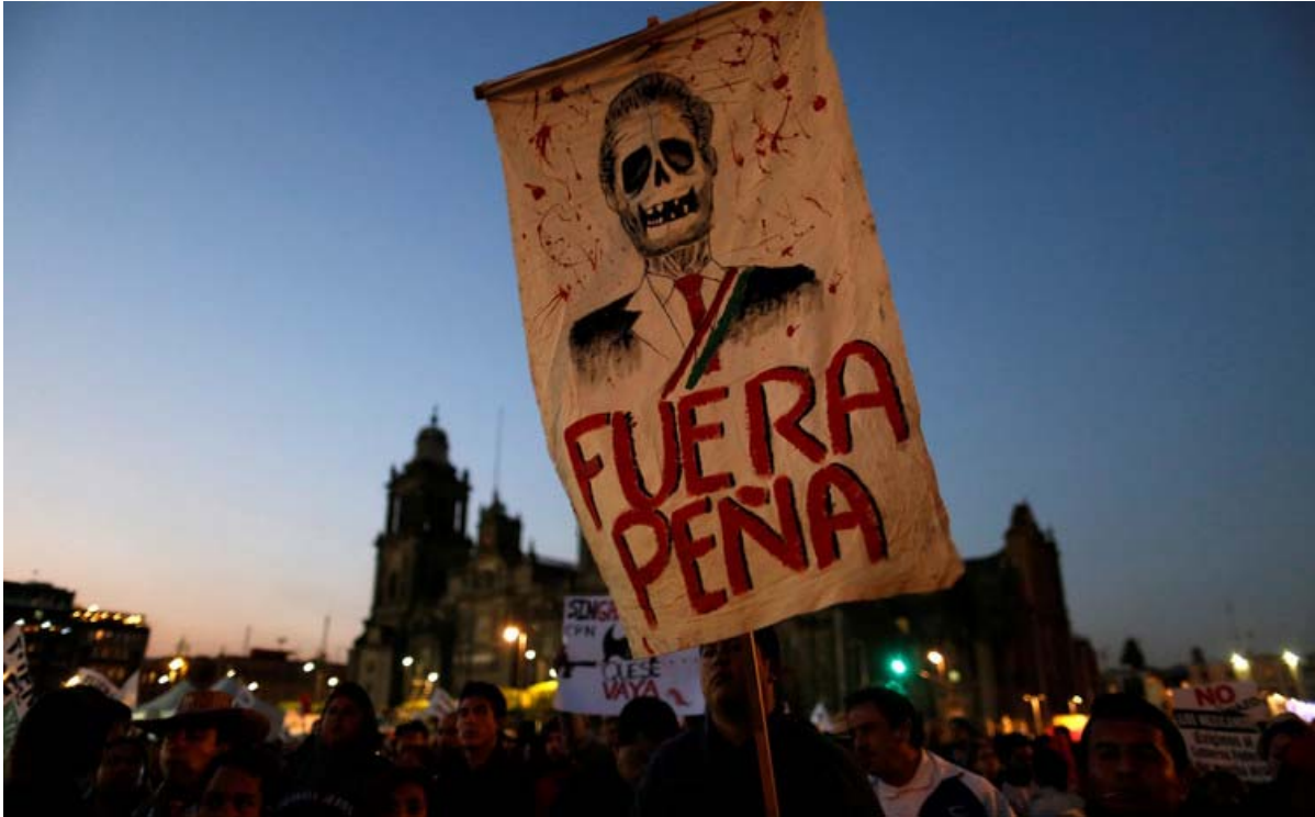
Calls for President Enrique Peña Nieto to resign are increasing.

Is this just a “zero-degree protest” – Slovenian cultural critic Slavoj Žižek’s term for violent actions demanding nothing? Or, as Mexican journalist Carmen Aristegui has suggested, are we witnessing a “Mexican Spring” – a protest movement that could blossom into an organised force for political change?