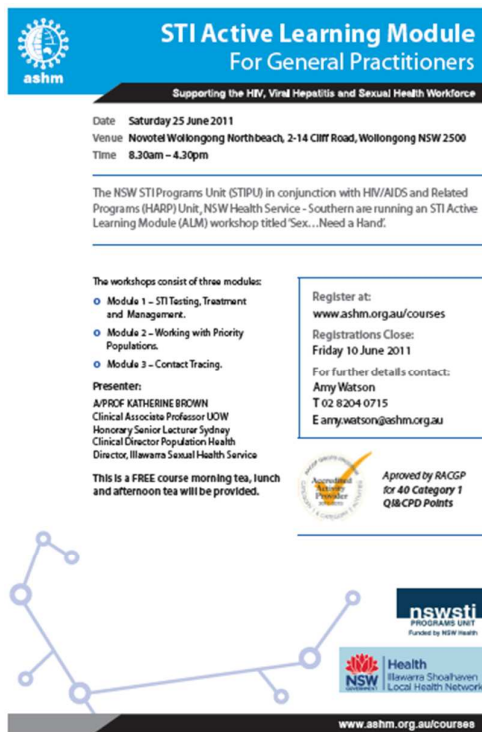
Figure 3: Active Learning Module