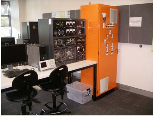
Figure 2 Teaching facility control station