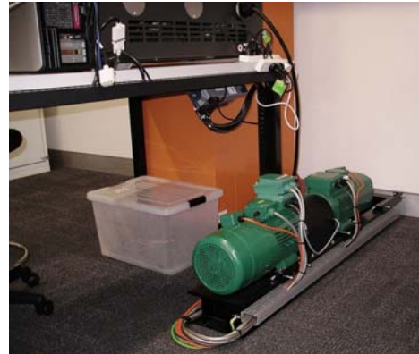
Figure 1 Teaching Facility motor assembly

The development of the curriculum and the training facility were inter-related; the facility had to be capable of delivering the required exercises for the curriculum. The curriculum requirements tended to drive equipment design in two ways: if a curriculum aim was to familiarise students with a certain piece of equipment the facility had to include it: if the aim was to examine a particular phenomena, it had to be present and visible in the facility, often requiring sensors and data acquisition.