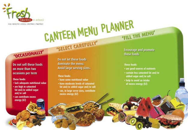
Figure 2 The traffic light system for planning canteen menus in NSW schools.

social marketing instruments. For instance, in New South Wales (NSW), the state government introduced a policy to control the foods bought and sold in school canteens. School lunch programs are not offered in Australian public schools. Students either bring their lunch from home, or purchase lunch from the school canteen. The policy is based around a traffic light system for planning canteen menus in NSW schools [19] and is represented in figure 2. Implementation of the policy is mandatory for public schools and voluntary for private schools. The 'Fresh Tastes Healthy Canteen Strategy' sits within the 'Healthier Schools' priority area of the NSW Government Action Plan for the Prevention of Obesity in Children and Young People 2003–2007 [20]. This approach requires schools to provide healthier food choices in line with the Australian dietary guidelines [21] and the Australian Guide to Healthy Eating [22].