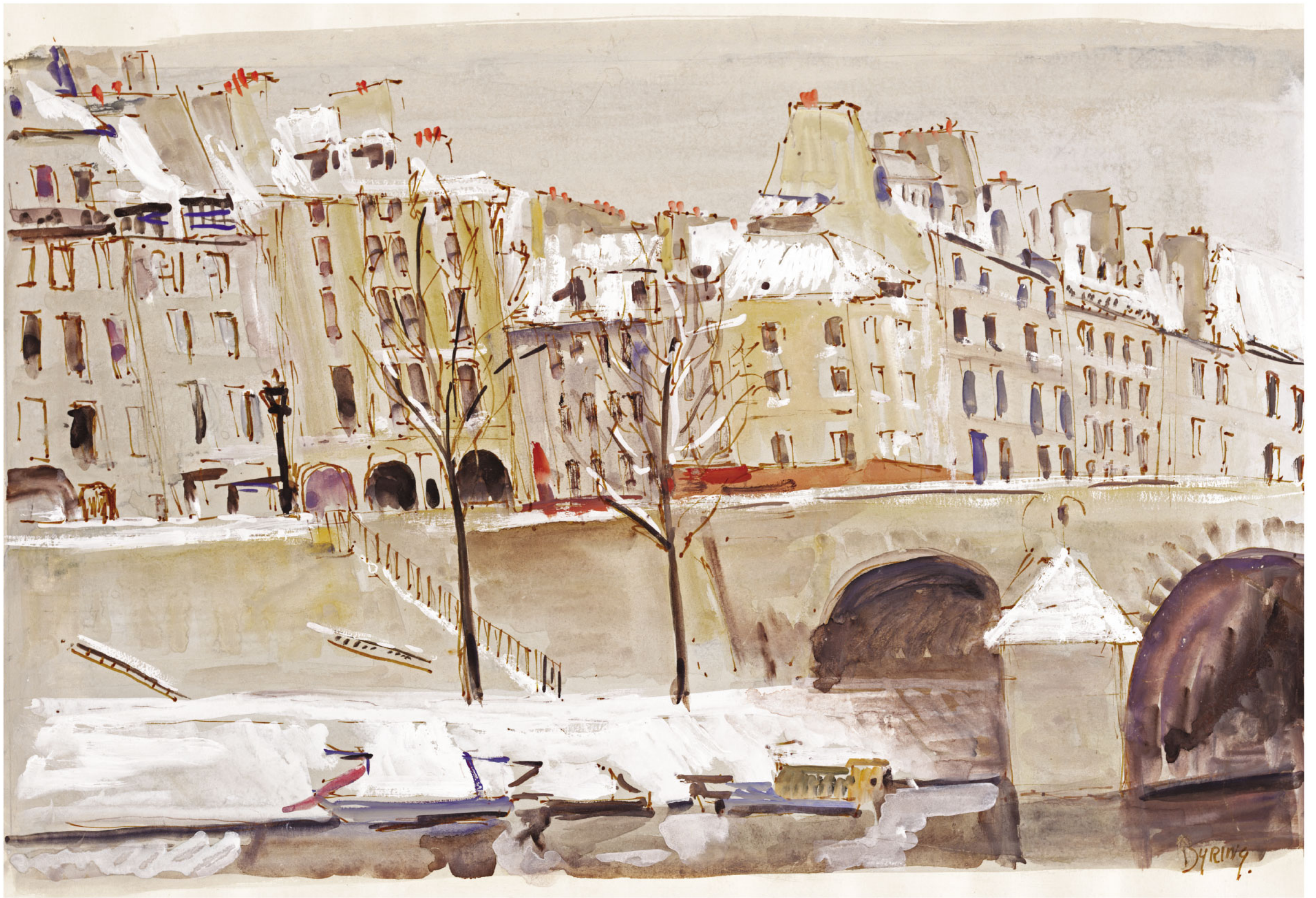
27 Moya Dyring Quai d'Anjou, Winter 1963