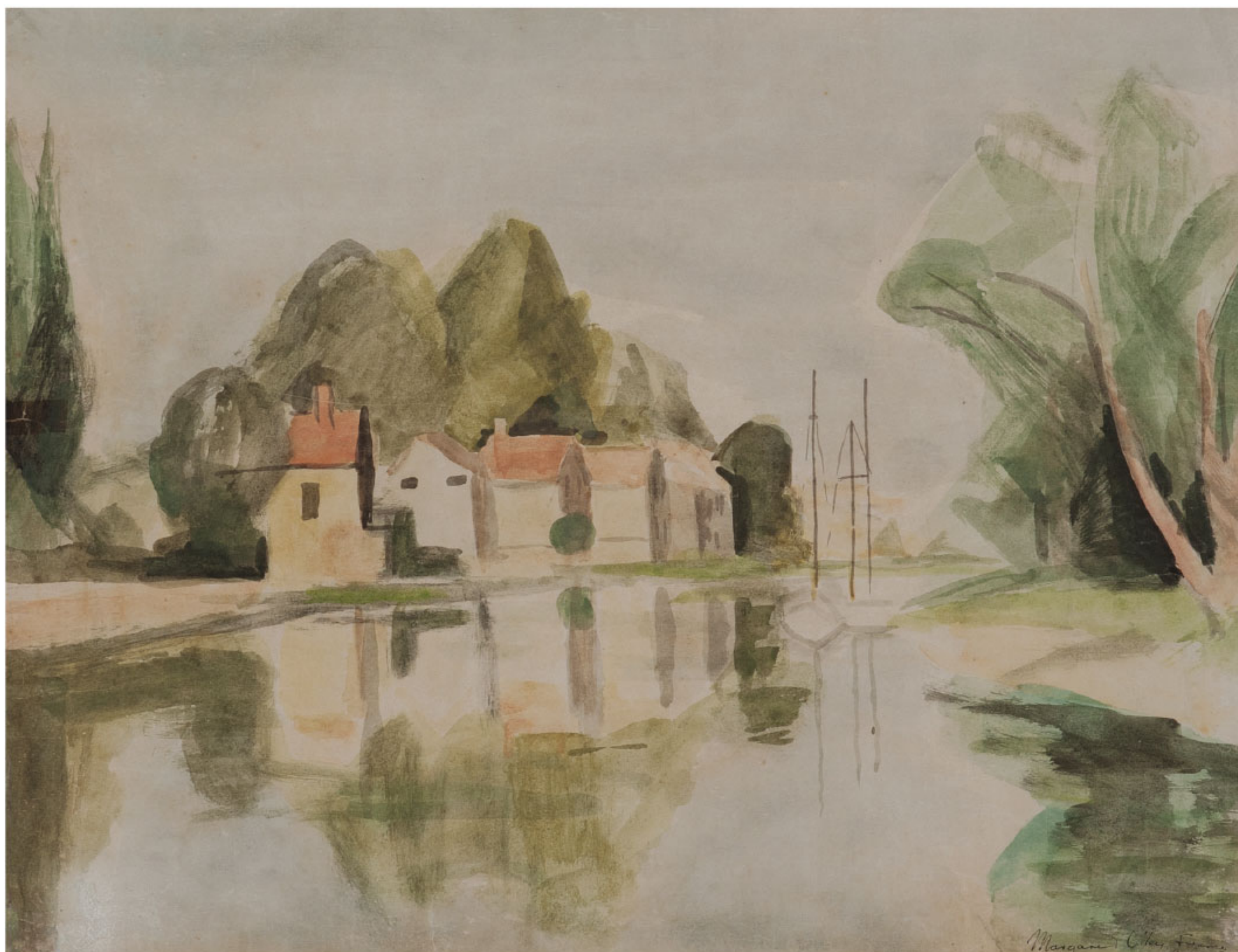
31 Margaret Olley France 1950