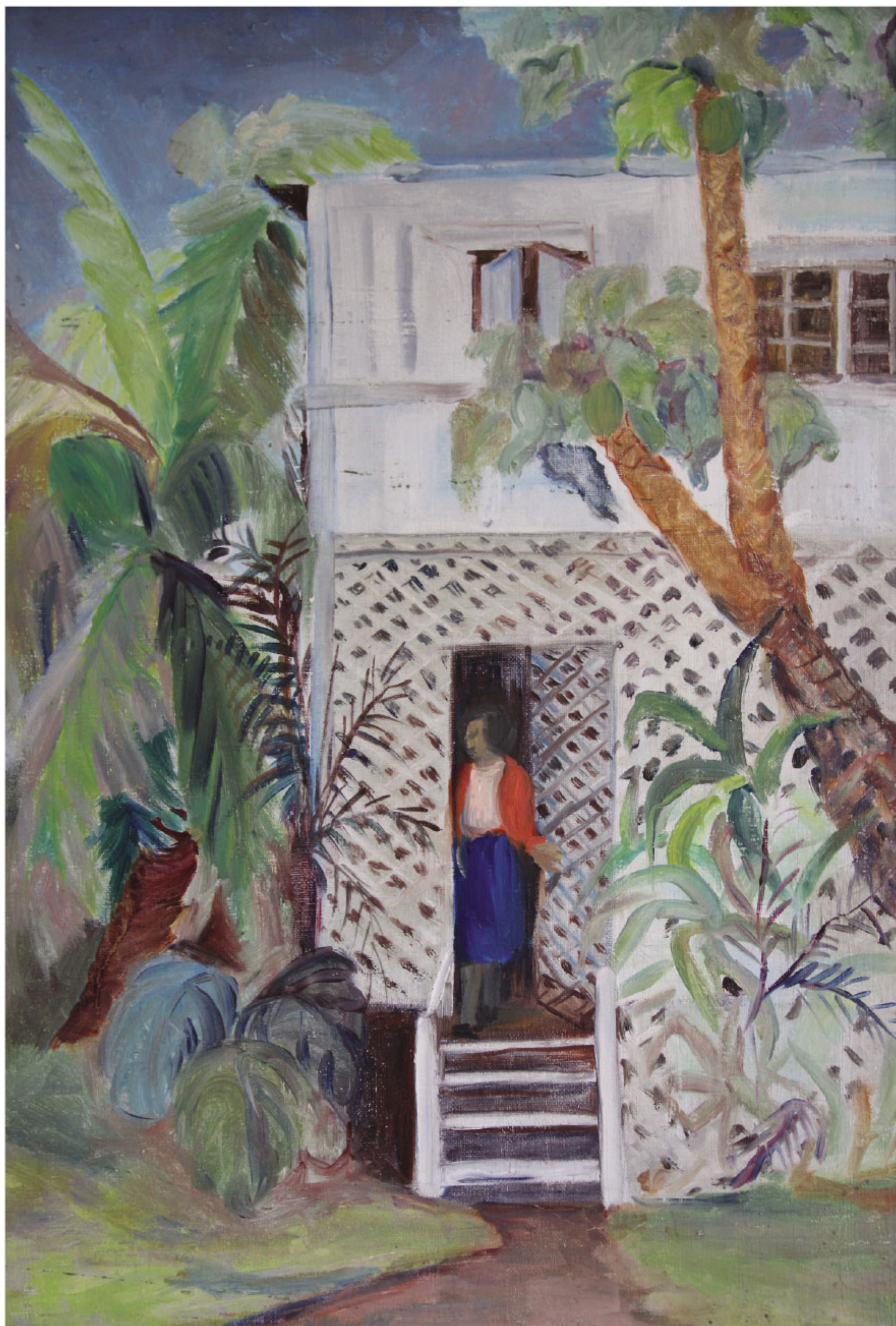
15 Moya Dyring Margaret Olley at 'Farndon', Brisbane c. 1955