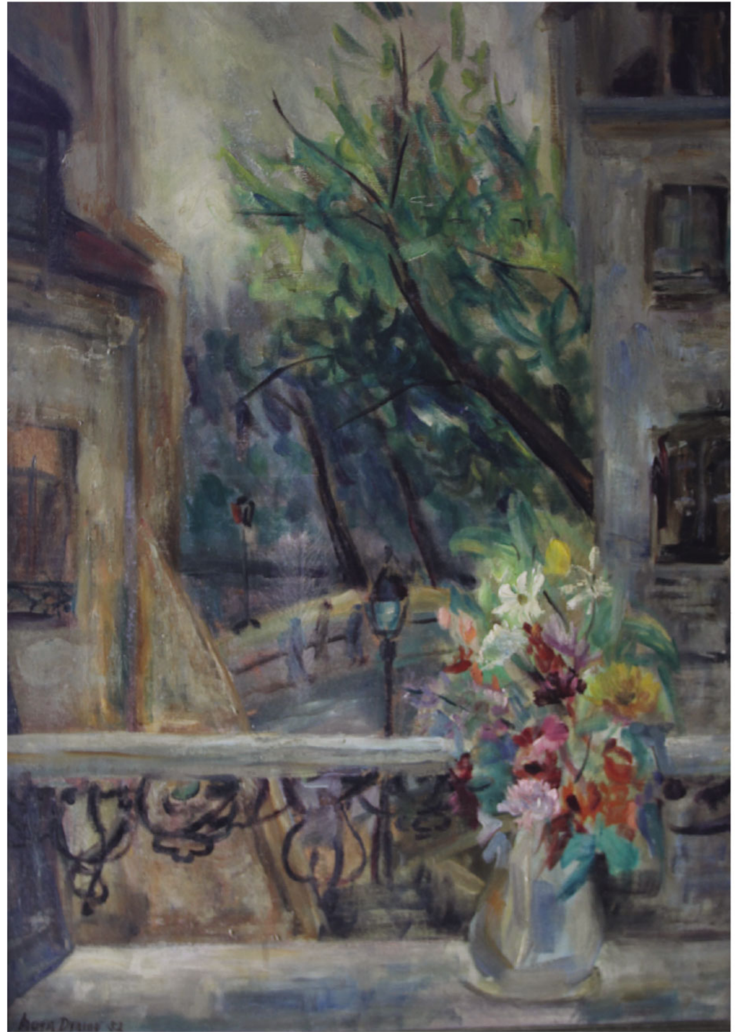
11 Moya Dyring View from the Studio 1952