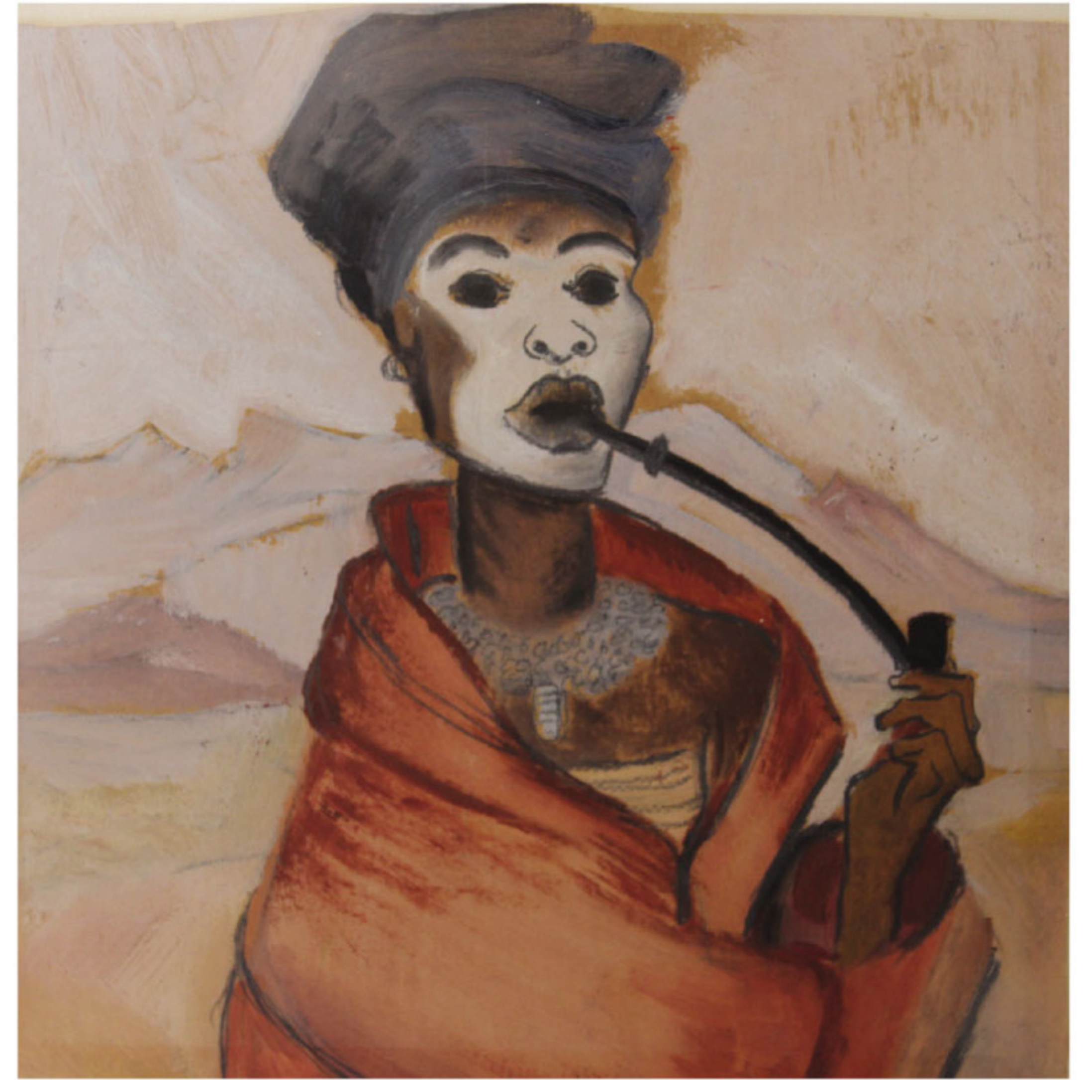
6 Moya Dyring African Woman c. 1940

subsequent visits to Australia, usually every three years, the two women continued their en plein air painting excursions. They travelled to Magnetic Island in 1953 and on a later visit they made a ten-day trip to Childers. Dyring's paintings Magnetic Island (1953), Margaret Olley at 'Farndon', Brisbane (1955) and The Blood House, Childers (1961) were produced during such travels in Queensland.