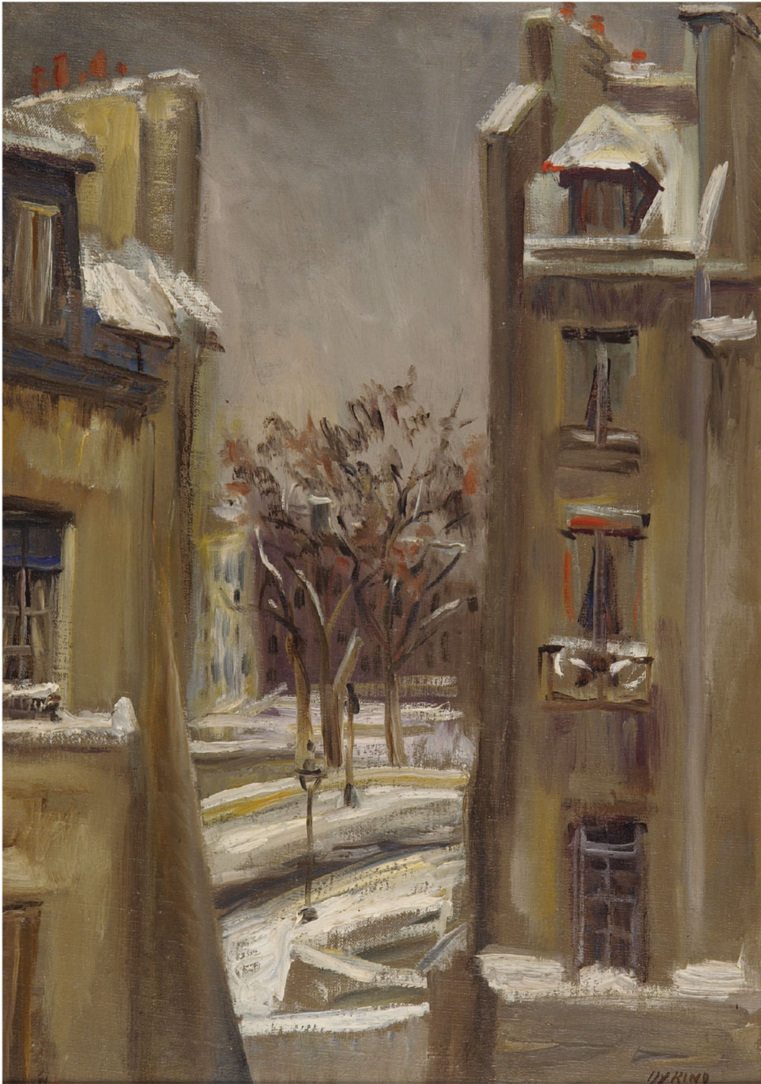
10 Moya Dyring View from Window 39 Quai d'Anjou, Paris c. 1950