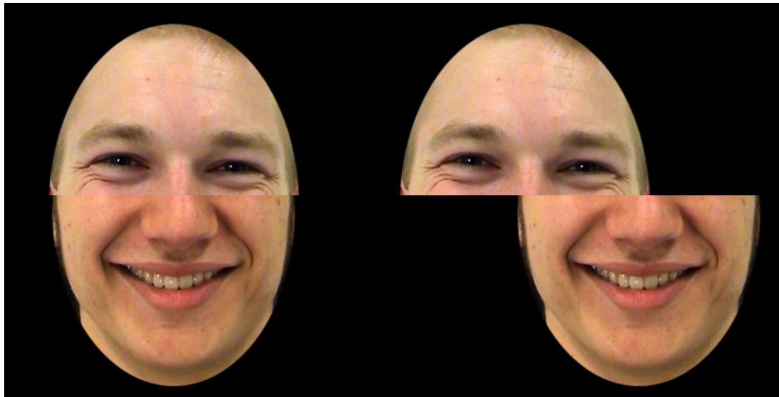
Figure 1. Example of an aligned and a misaligned static composite face. See supplemental material for examples of dynamic composites.

half faces and aligning the middle of the nose (see Figure 1 and supplemental material for dynamic composites). If necessary, bottom half faces were adjusted in size to match the external contours of the top half face.