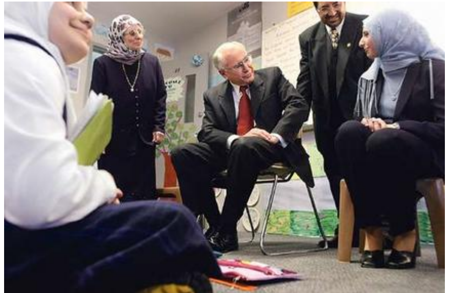
Making friends... John Howard unveiled a building at Al-Faisal College in Auburn yesterday.