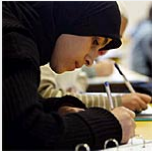
Impractical: Mr Howard says if headscarfs are banned other forms of dress would have to be included.