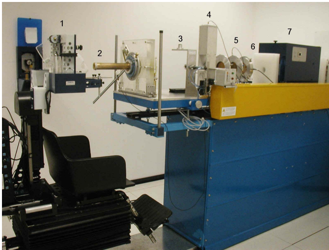
Fig. 1. The CATANA hadron therapy beam line: 1. Treatment chair for patient immobilization; 2. Final collimator; 3. Positioning laser; 4. Light field simulator; 5. Monitor chambers; 6. Intermediate collimator; 7. Box for the location of the energy modifier devices.

The chamber is moved by a computer-controlled stepping motor in 0.2 mm steps to perform the experimental Bragg peak measurement. During the movement the ionisation current, normalized to the reference beam current, is measured as a function of the depth in water; this series of measurements provides the Bragg peak profile. The normalization avoids the effects of the proton beam instability during the measurement. The error of the current has been measured to be 2.5 %.