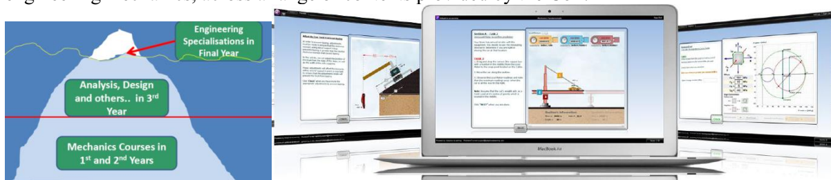
Figure 1: (a) Iceberg of mechanics in engineering (b) Snapshot of Adaptive Tutorials

This paper evaluates how the ATs have been able to help student learning of threshold concepts in engineering mechanics, across a range of contexts provided by the CoP.