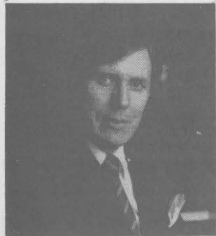
Michael Kirby President NSW Court of Appeal

1988 should be a year of shame, yet also a year of action against racism.