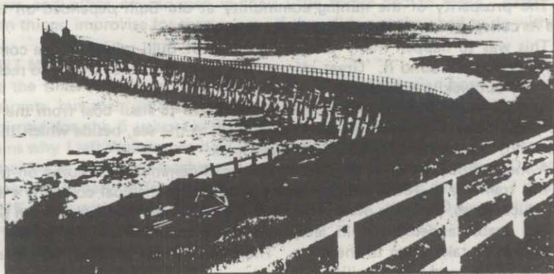
● Bulli Jetty, the area's lifeline, pictured in 1920.