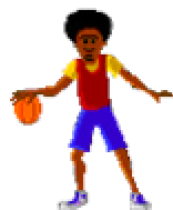
Diagram 2: The animated gif of a basketball player

The graphics used did not always present content information as some were used for aesthetic reasons or to be visual cues to aid navigation. There were several examples of graphics being used for layout purposes that did not directly contribute to the content. The use of layout graphics increased the visual attractiveness of the resources in ways that could encourage student attentiveness to the resource. The graphics were also used to entertain and to emote feelings of warm and empathy in the learner. An example of this was the gif in “Energy & Change” shown in Diagram 2.