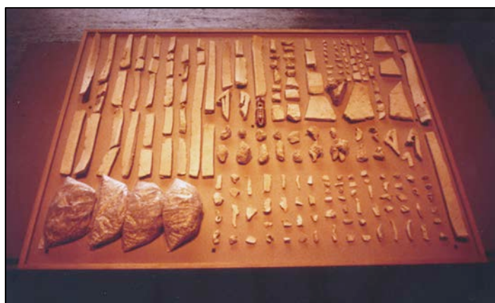
Jon Cockburn (b.1953), Talking about my childhood: Tacky , 1981, ceramic fragments, cotton, wood and wood figurine, plastic bags, on matt board, 818mm x 1017mm, height approximately 80mm, 19 December 1981 to 30 January 1982, Wynne Exhibition (Sculpture), AGNSW, Sydney.