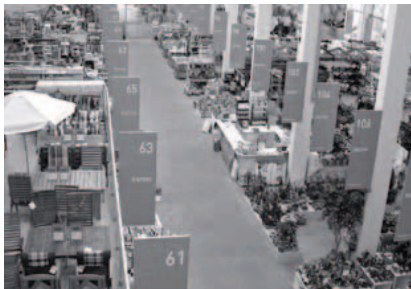
FIGURE 1 A typical bauMax store layout

In the initial step, managerial input is required to establish the underlying pricing conditions. This is also the point at which any necessary modifications, based on the feedback and experience from the previous rounds of pricing, are incorporated into the system.