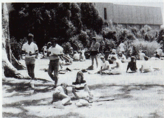
Above: The University campus which won first prize in the annual City of Wollongong Garden Competition and, below, landscaping at Kooloobong which earned a special award