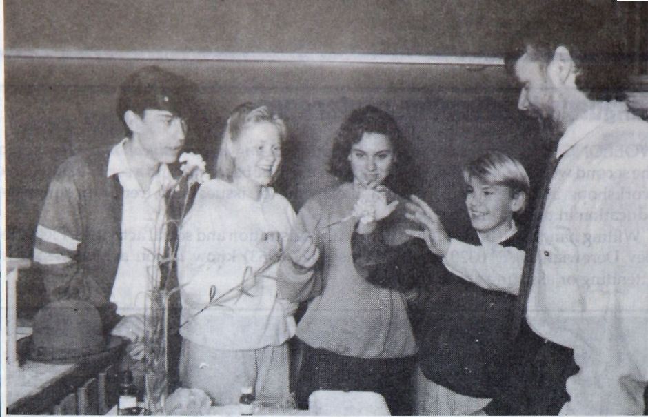
Some 200 Year 10 students from schools in western NSW visited the Science Faculty on June 22. In the Chemistry Department they were entertained by a 'Magic Chemistry Show'