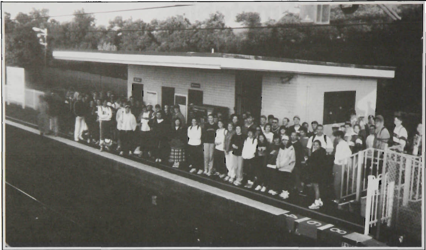
The Campus East team

Students and staff at the Campus East residential accommodation once again proved to be a formidable force in this year's Sydney City to Surf run on 11 August.