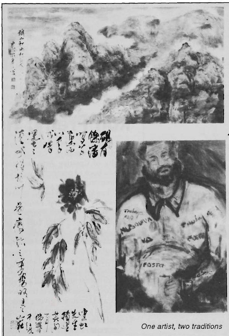
One artist, two traditions