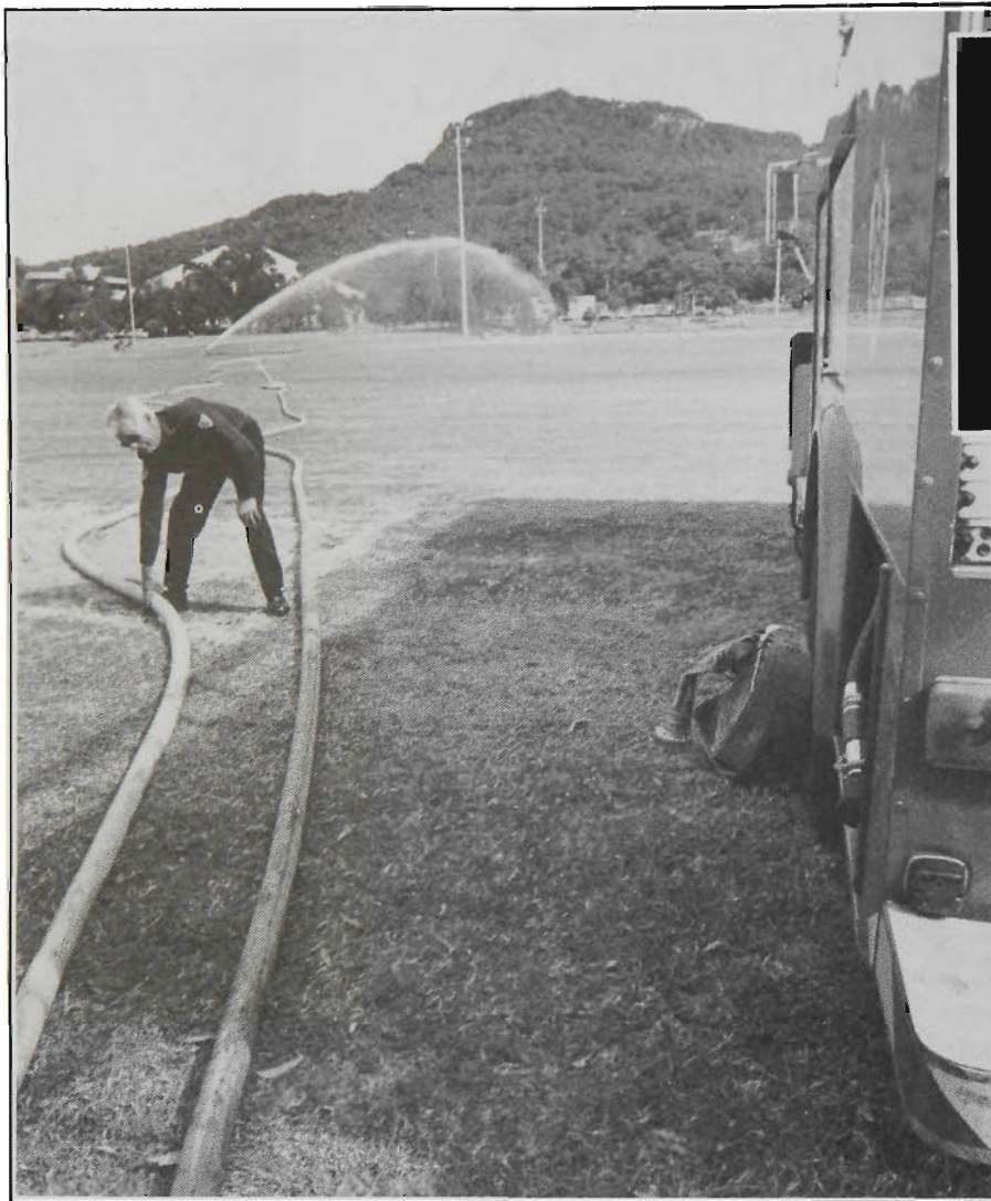
How to water playing fields in a drought